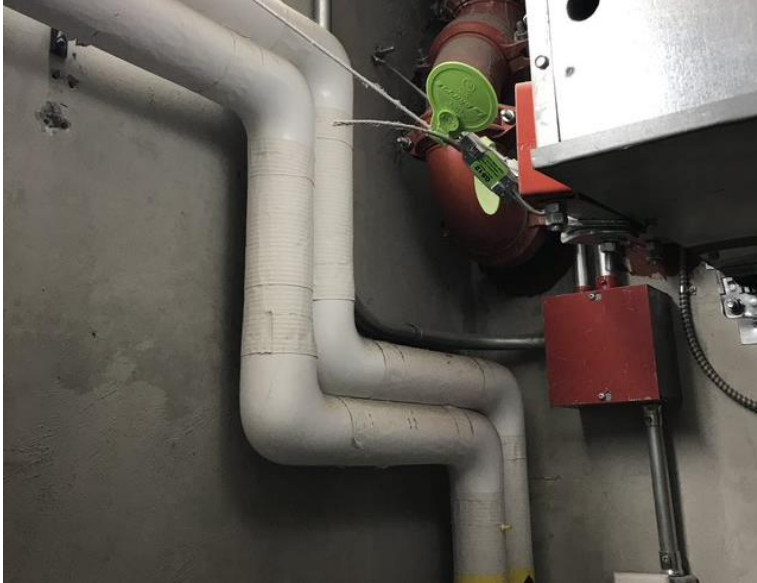
Photo 1: View of fibreglass pipe insulation observed in the parking garage of the subject building.