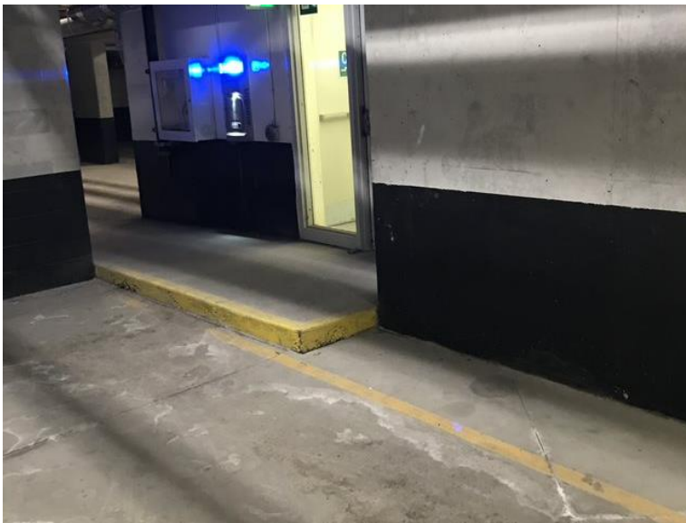
Photo 2: View of the low level lead paints (black and yellow) observed in the parking garage of the subject building.