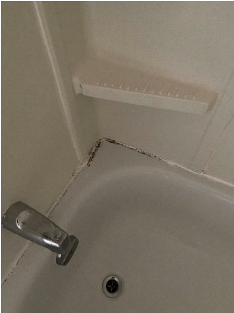
Photo 10: View of suspected mould growth in corner of bathtub in the second floor bathroom.