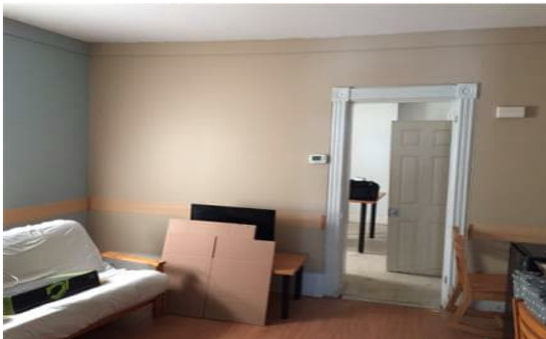
Photo 2: View of typical finishes observed at the building located at 120 Henderson Avenue.