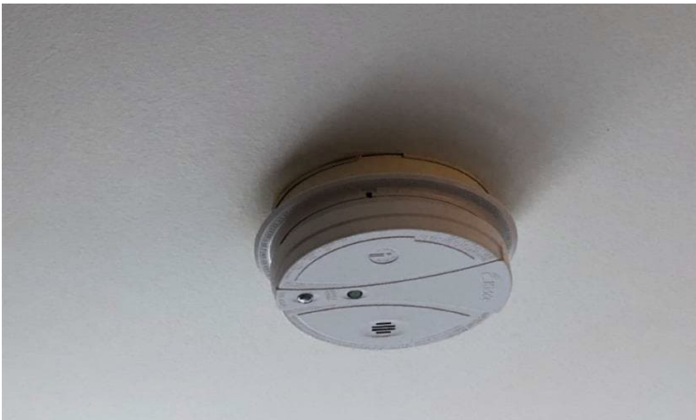
Photo 11: Typical view of smoke detectors containing radioactive materials.