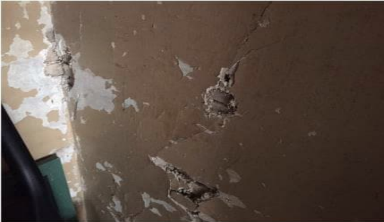
Photo 4: View of asbestos-containing wall plaster observed to be in poor condition, at the top of the basement stairs.