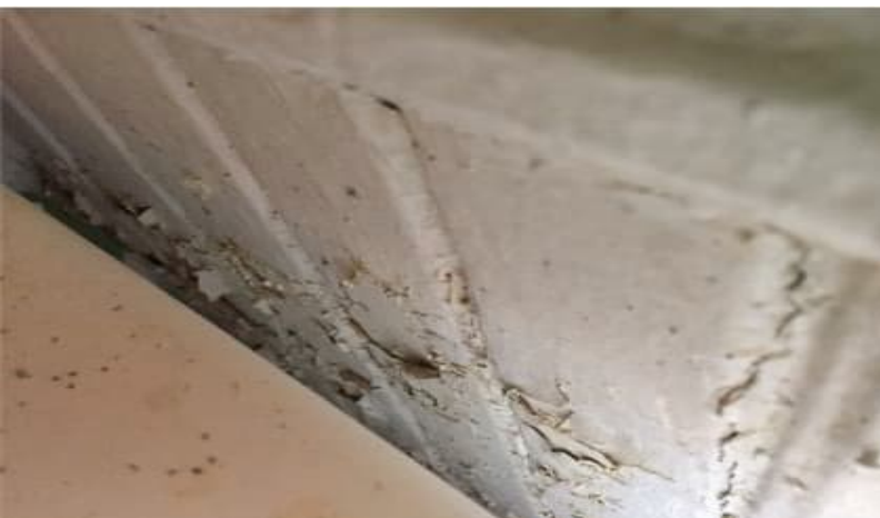
Photo 6: View of lead-containing white paint observed to be in poor condition in the bathroom on the 2 nd floor.