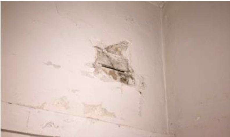
Photo 5: View of asbestos-containing wall plaster observed to be in poor condition in the closet across from the bathroom on the 2 nd floor.