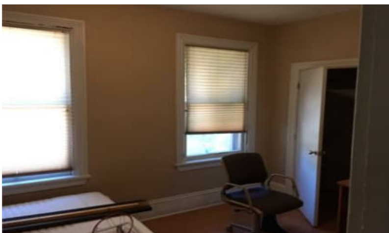
Photo 3: View of typical finishes observed at the building located at 120 Henderson Avenue.