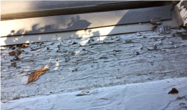
Photo 7: View of lead-containing white paint observed to be in poor condition in Room E on the 2 nd floor.