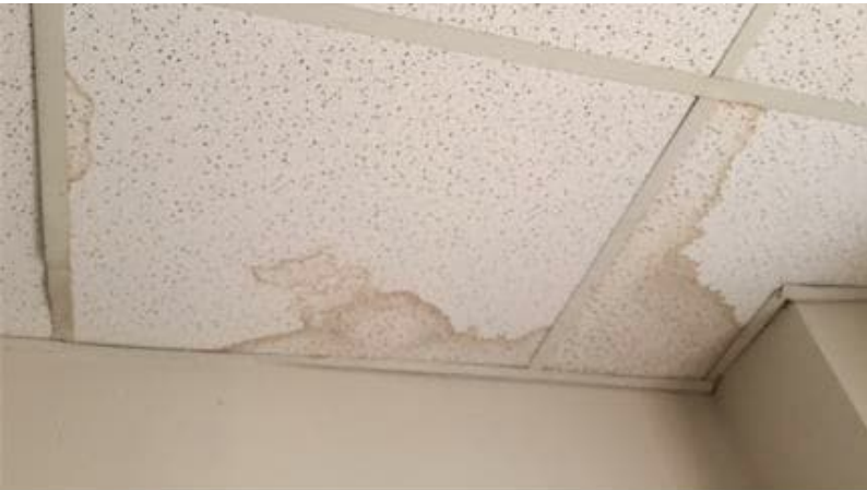
Photo 8: View of water-damaged suspended ceiling tiles observed in the 2 nd floor hallway.