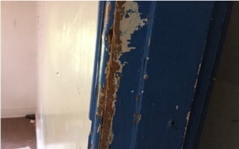
Photo 7: View of lead-containing blue paint observed to be in poor condition on the 3 rd floor.