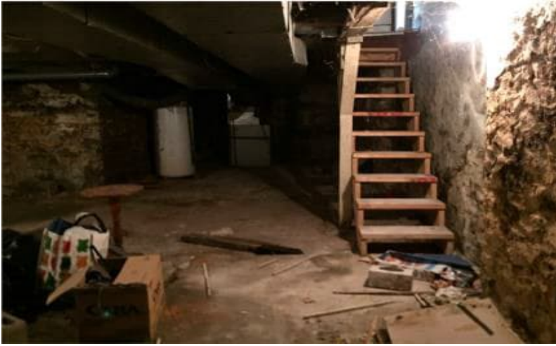
Photo 4: View of typical finishes observed at the building located at 128 Henderson Avenue.