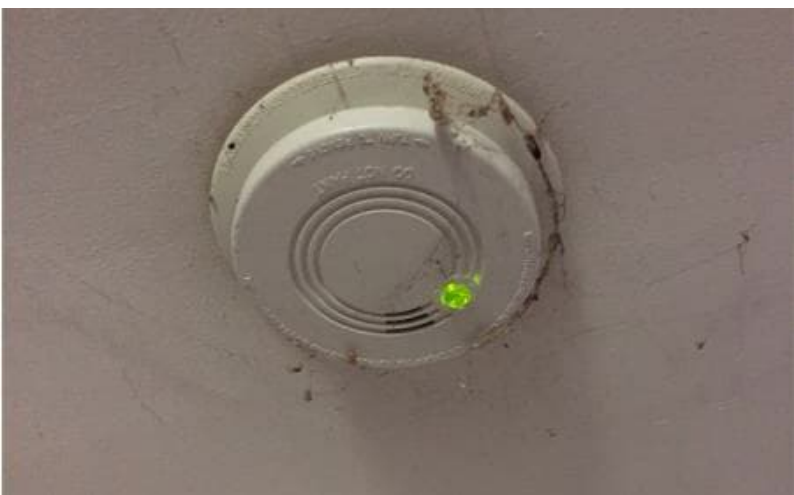
Photo 9: Typical view of smoke detectors containing radioactive materials.