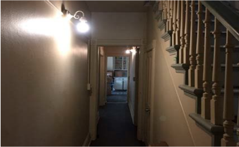
Photo 1: View of typical finishes observed at the building located at 128 Henderson Avenue.