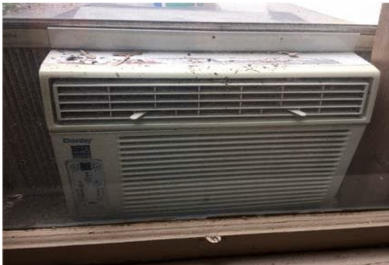
Photo 10: View of suspected ODS containing air-conditioning unit in Room D on the 1 st floor.