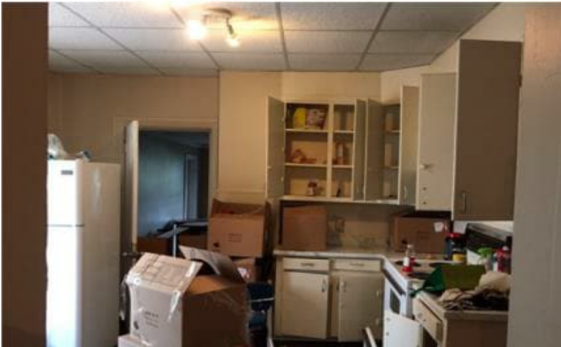
Photo 2: View of typical finishes observed at the building located at 128 Henderson Avenue.