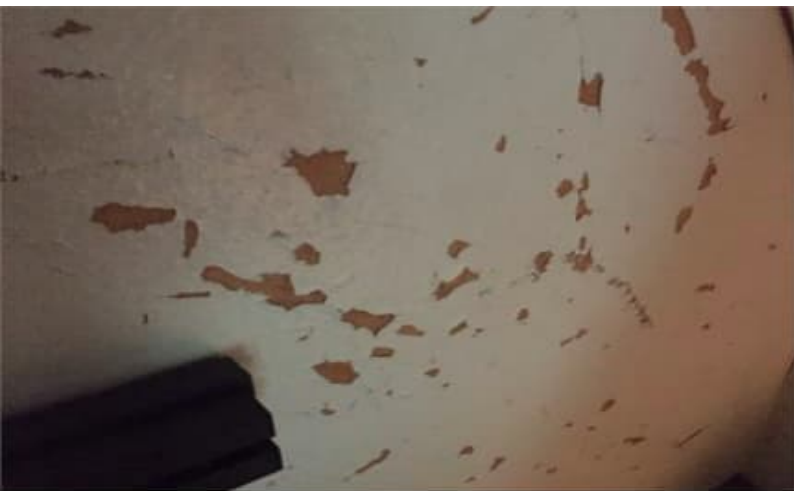
Photo 8: View of lead-containing white paint observed to be in poor condition on the wall near the stairs to the 3 rd floor.