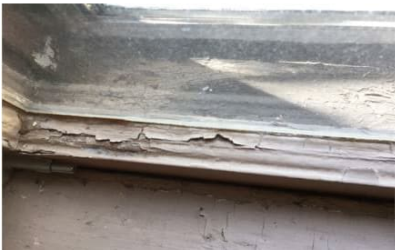
Photo 6: View of lead-containing beige paint observed to be in poor condition in Room C on the 2 nd floor.