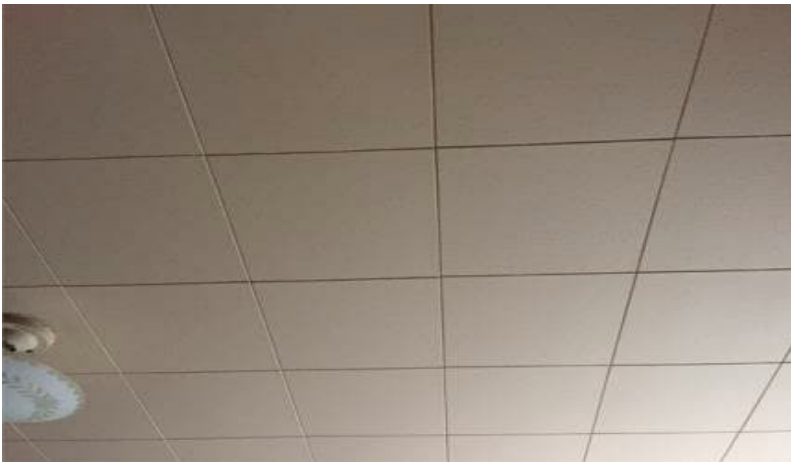
Photo 5: View of non-asbestos-containing acoustic ceiling tiles (1'x1') observed in Room D on the 1 st floor.