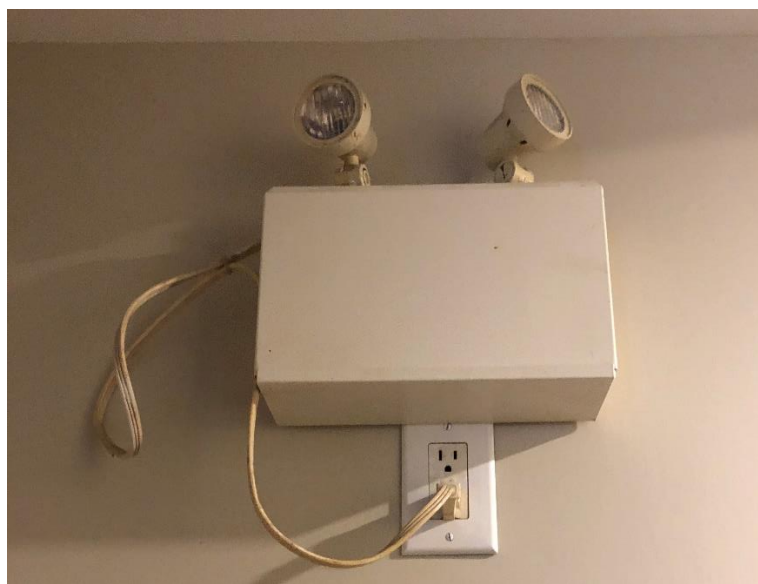
Photo 6: View of lead acid battery pack observed throughout the building

Photo 5: View of water damaged plaster ceiling observed in the basement dining area