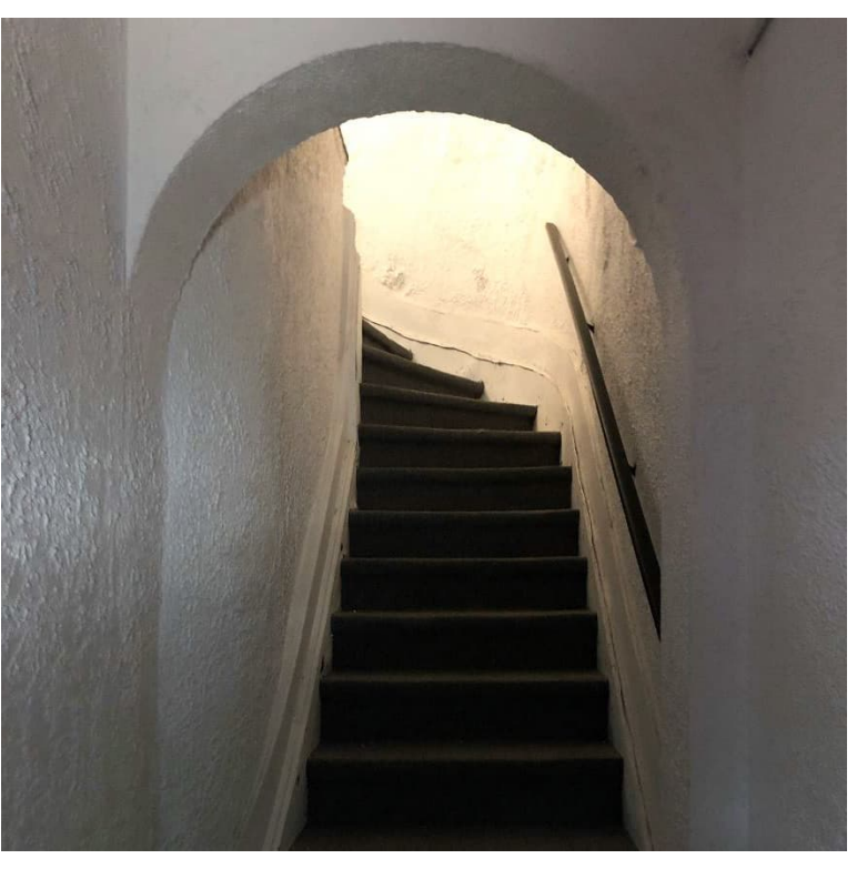
Photo 2: View of asbestoscontaining texture coat observed in the apartment stairway