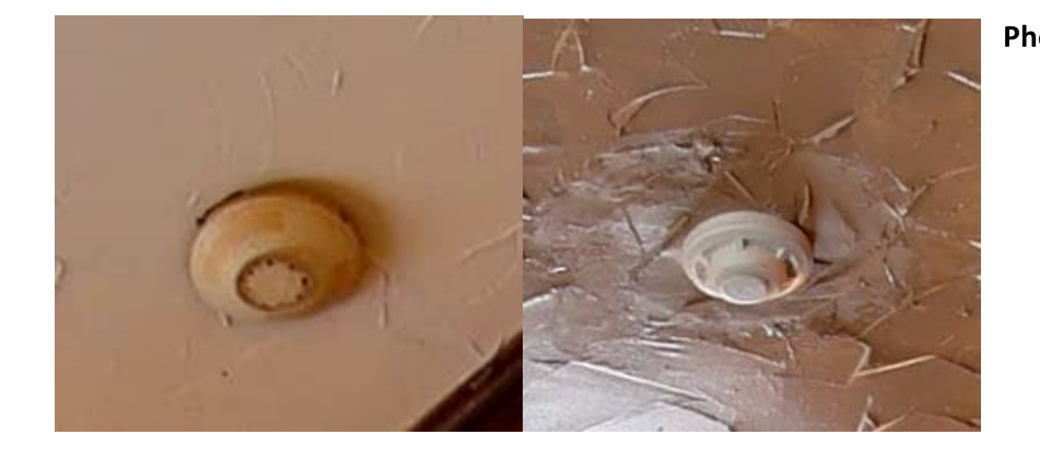
Photo 7: View of smoke detectors with radioactive material present throughout the building.

Photo 8: View of asbestoscontaining texture coat present on walls observed in fair condition in the hallway of the subject building during the 2022 Reassessment.