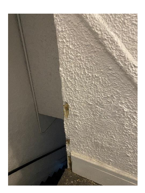
Photo 9: View of suspect mould observed in Unit 2 of the subject building during the 2022 Reassessment.