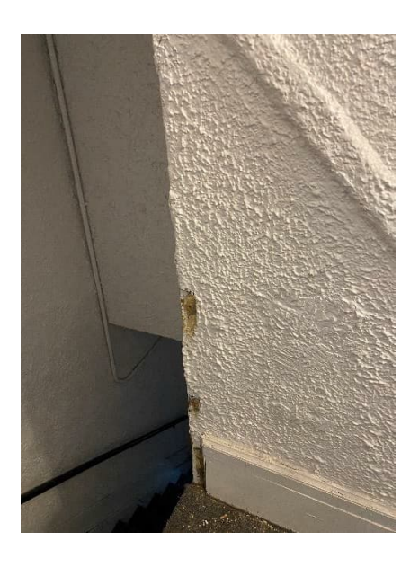
Photo 9: View of suspect mould observed in Unit 2 of the subject building during the 2022 Reassessment.

Photo 8: View of asbestoscontaining texture coat present on walls observed in fair condition in the hallway of the subject building during the 2022 Reassessment.