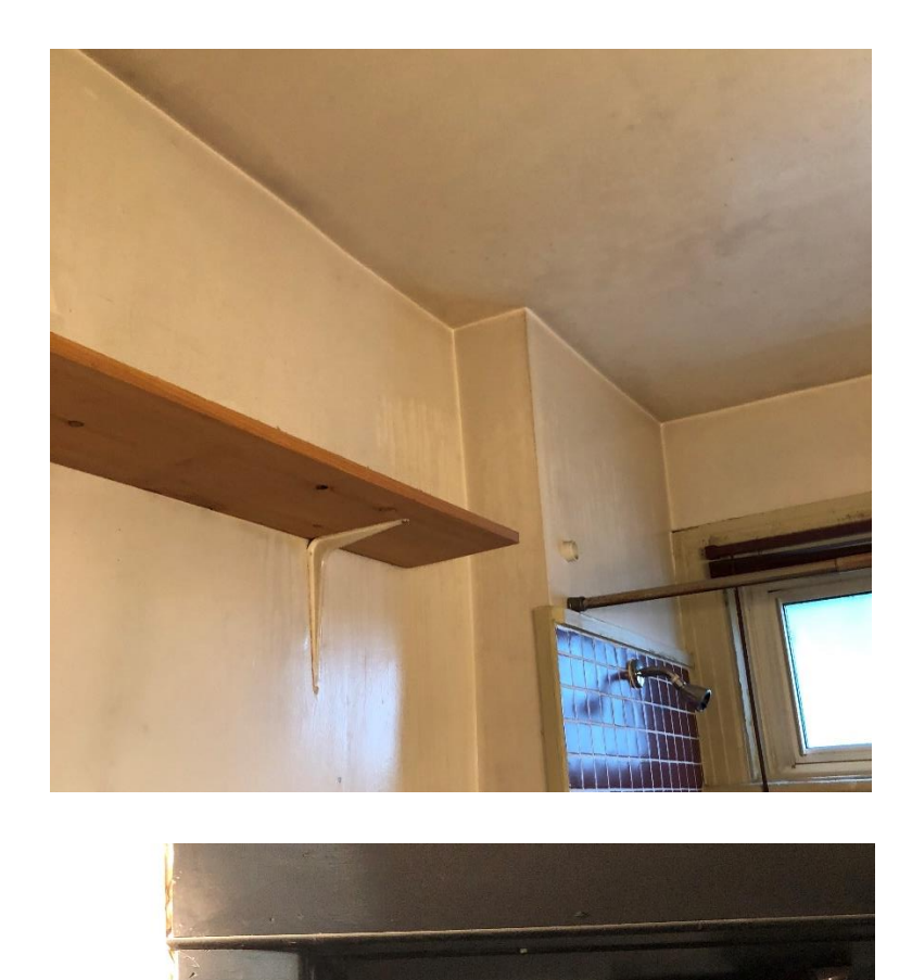
Photo 3: View of lead containing white wall paint observed in the apartments

Photo 4: View of lead containing black trim paint observed in the apartment stairwell