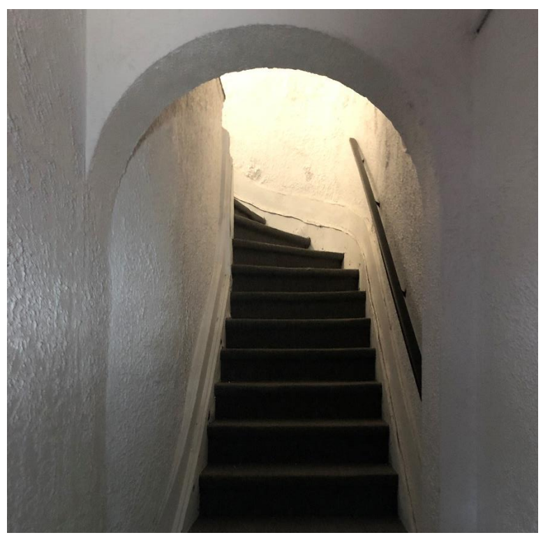
Photo 2: View of asbestoscontaining texture coat observed in the apartment stairway

Photo 1: View of asbestoscontaining drywall joint compound observed in the basement hallway