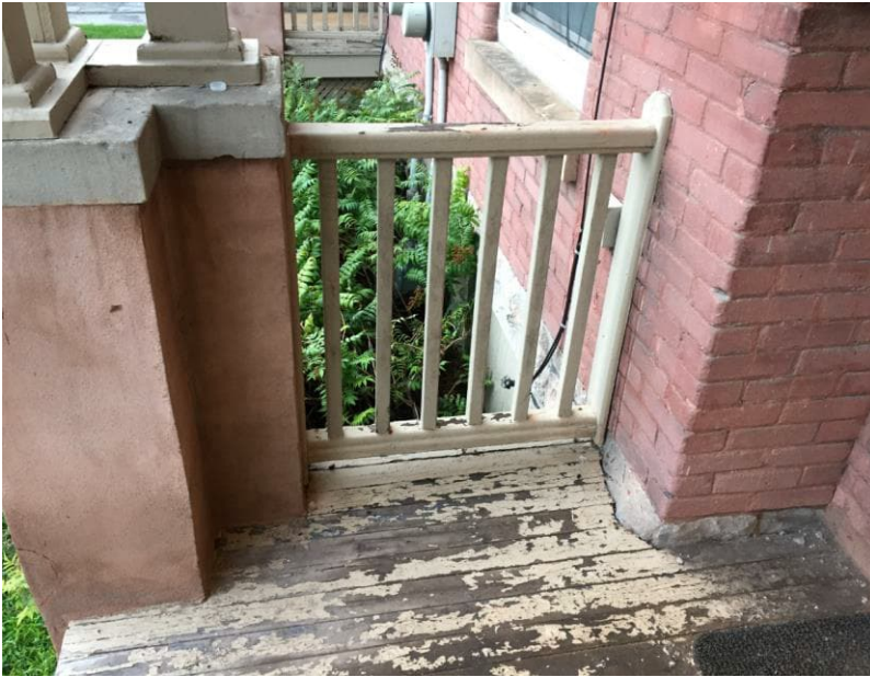
Photo 7: View of lead containing grey/brown paint observed on the porch and deck at 19-21 Stewart, observed in poor condition.