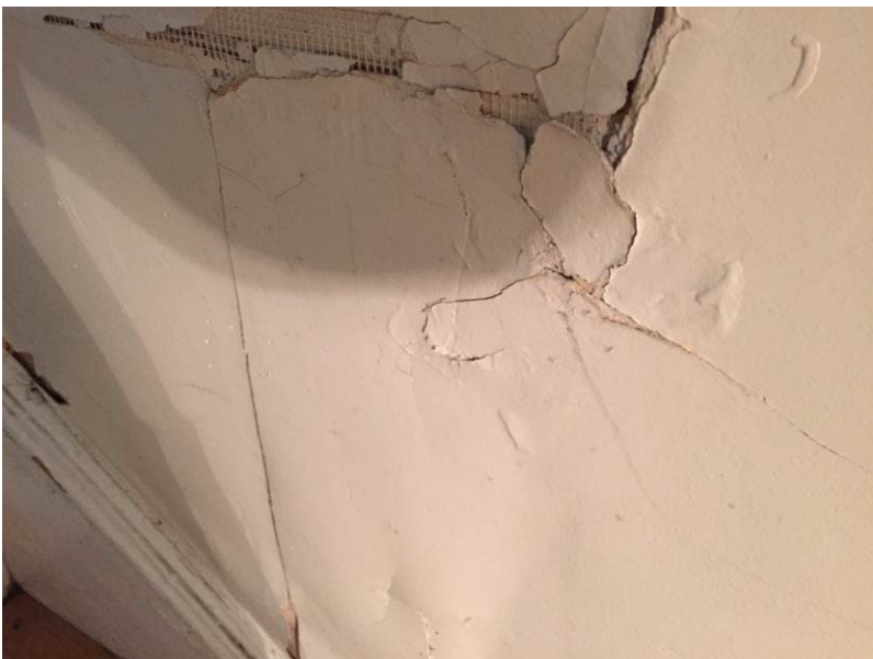
Photo 4: View of poor-condition asbestos-containing plaster observed on the stairs to the second floor in 19 Stewart.