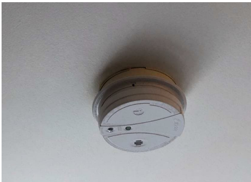
Photo 11: Typical view of smoke detectors containing radioactive materials.