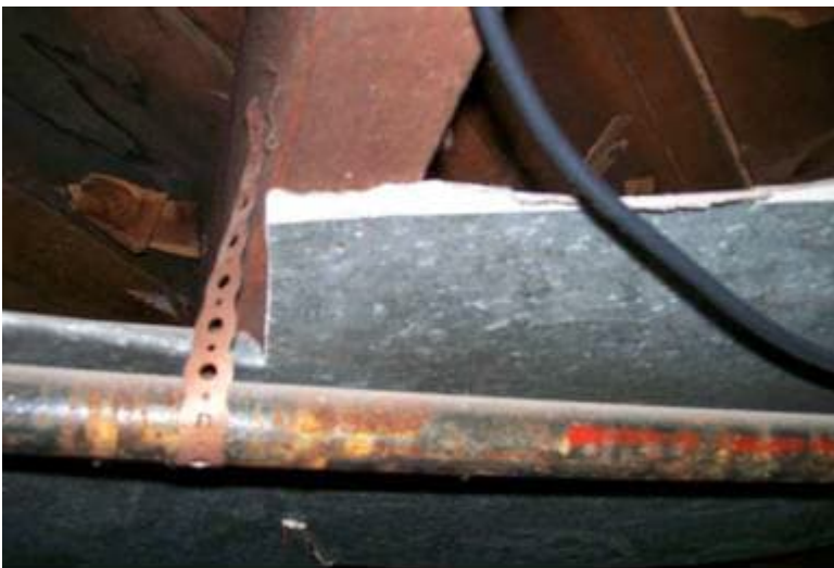
Photo 6: View of asbestos-containing paper insulation observed above the hot water tank in the basement of 19 Stewart.