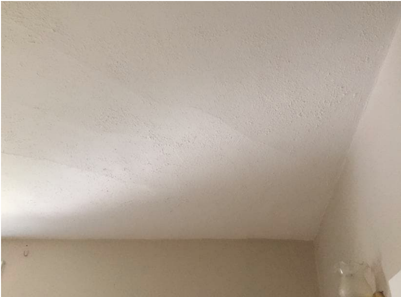
Photo 5: View of asbestos-containing texture coat observed in Room F of 19 Stewart.