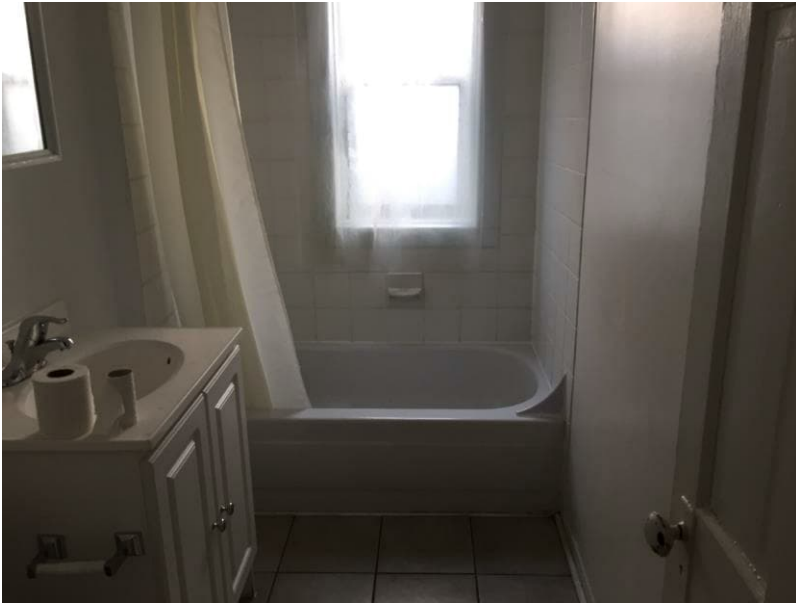
Photo 3: View of typical finishes observed at the building located at 19-21 Stewart Street.