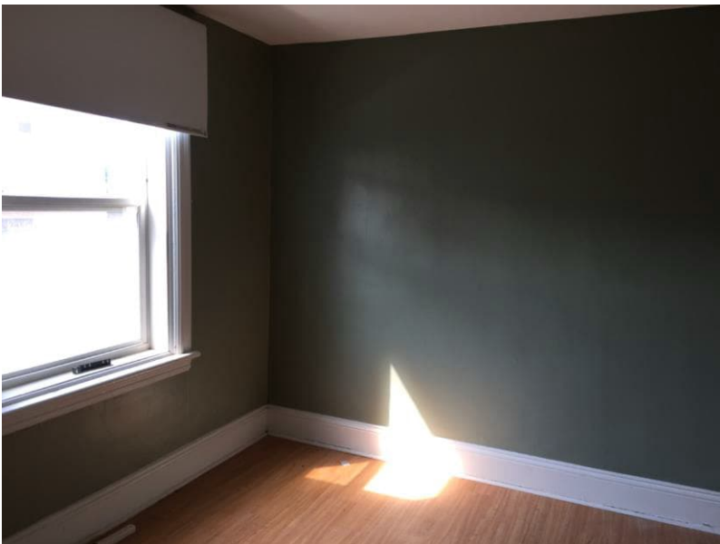
Photo 8: View of lead containing green paint observed in Room C at 19 Stewart.