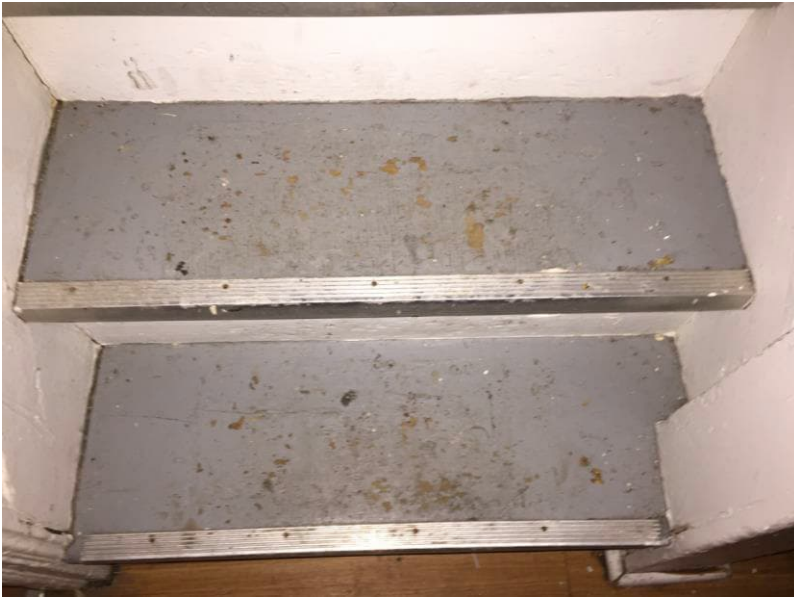
Photo 9: View of lead containing grey paint and previously identified lead containing blue paint observed on the staircase to the second floor at 21 Stewart.