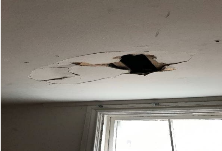
Photo 1: View of asbestos-containing drywall joint observed to be damaged on the ceiling on the 1 st floor of the subject building.