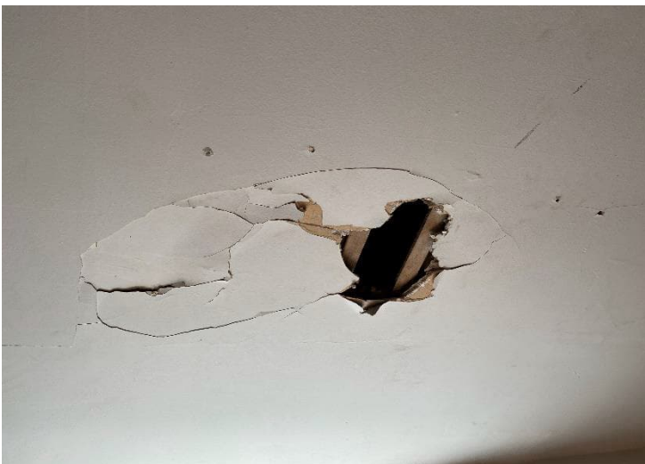
Photo 3: View of asbestos-containing drywall joint compound observed to be damaged on the ceiling on the 1 st floor of the subject building.