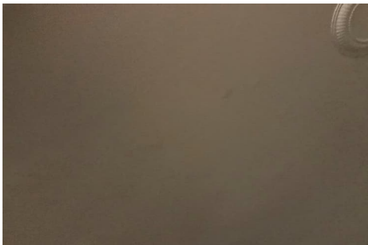
Photo 4: View of white lead based paint observed at 546 King Edward Ave.