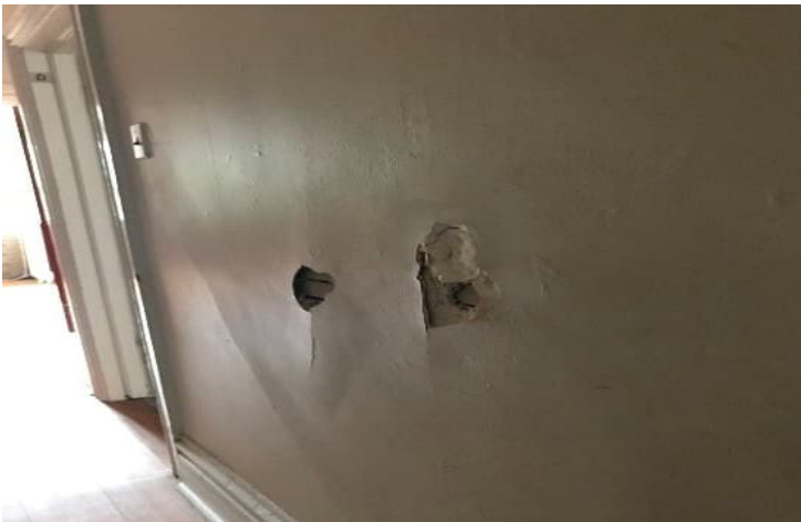
Photo 2: View of asbestos-containing drywall joint compound observed to be damaged in the hallway of the 2 nd floor.