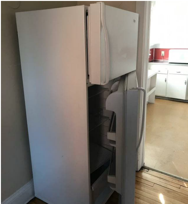
Photo 4: View of the refrigerator, suspected of containing ozone-depleting substance observed in the kitchen.