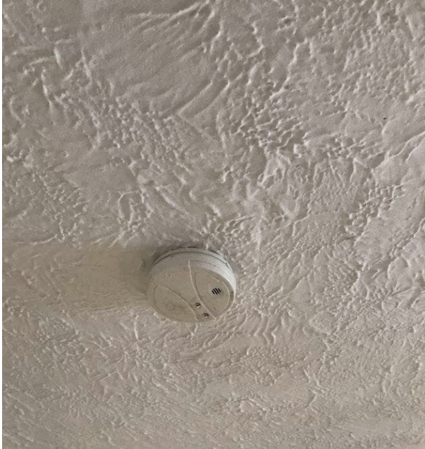
Photo 3: Representative view of the smoke detector containing Americim 241 observed at various locations of the subject building.