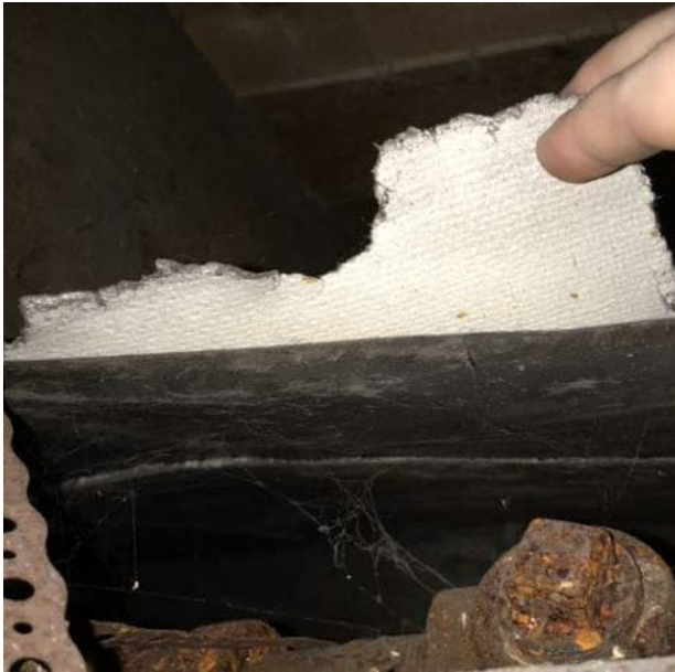
Photo 1: Grey paper observed in the basement ceiling above furnace beneath sheet metal containing 60% Chrysotile asbestos.