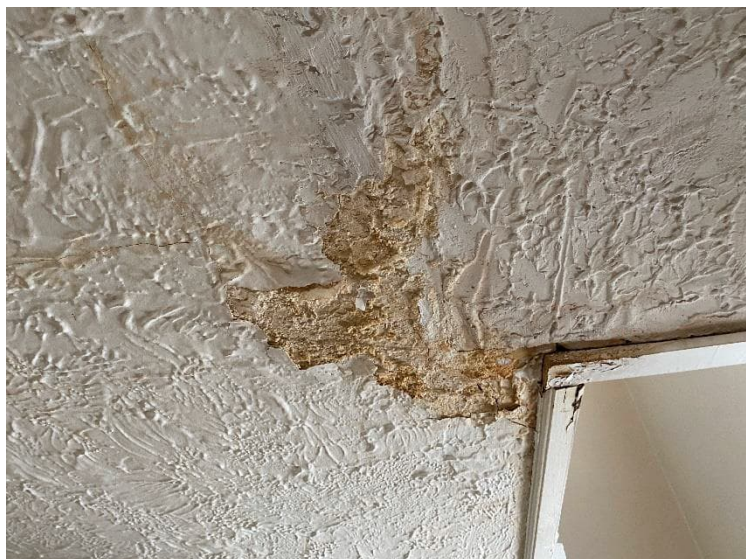
Photo 5: View of water-damaged texture coat on ceiling observed at the front entrance on the main floor of the subject building during the 2022 reassessment.