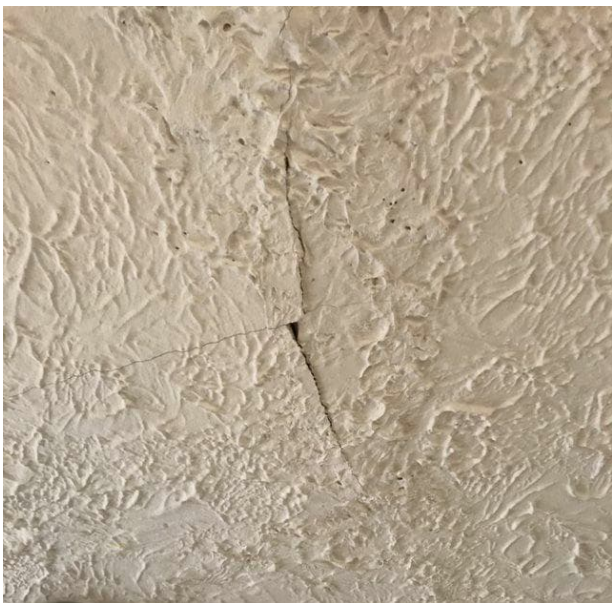
Photo 2: View of the non-asbestos containing ceiling texture finishes observed at various locations in the subject building.