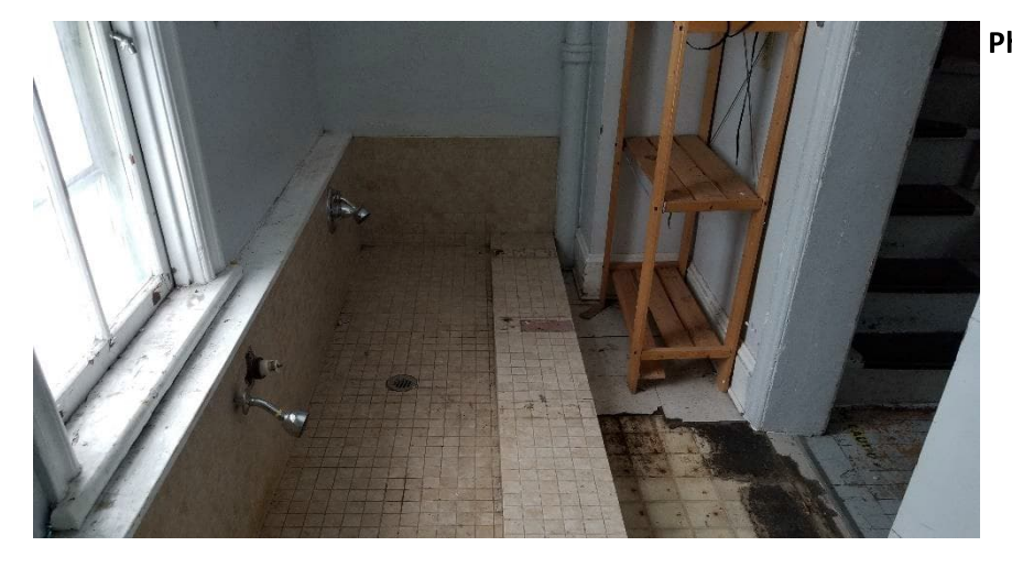
Photo 2: View of non-asbestos vinyl sheet flooring underneath vinyl floor tiles in Room 105.