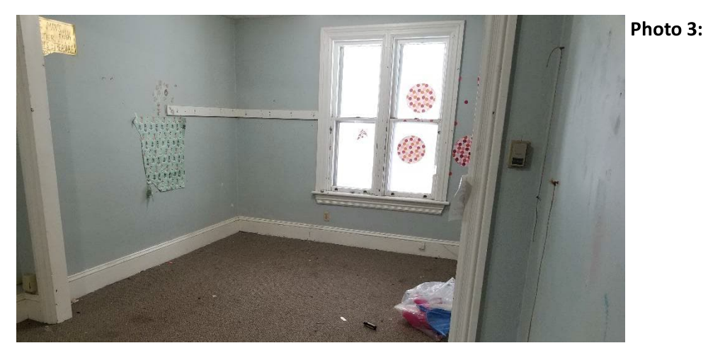
: Typical view of asbestos-containing drywall joint compound observed throughout the subject building.