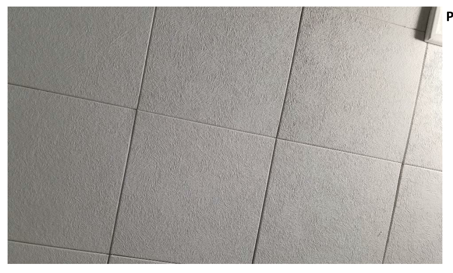
Photo 4: View of non-asbestos ceiling tiles (1' x 1') observed in Room 102.