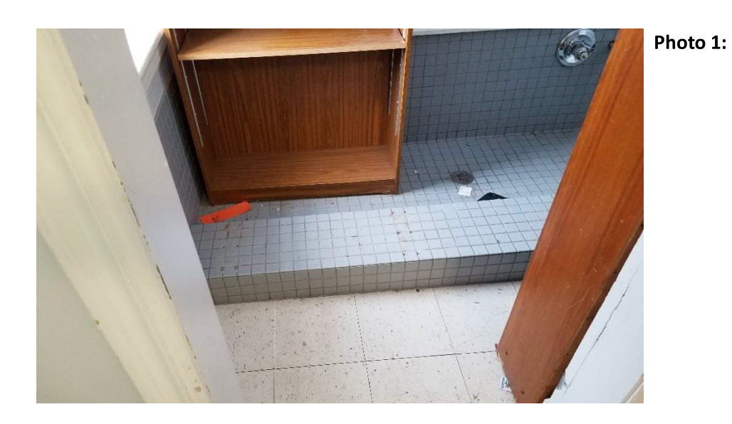
View of non-asbestos vinyl floor tiles (12" x 12") and ceramic floor tile grout suspected of containing asbestos in Room 205.