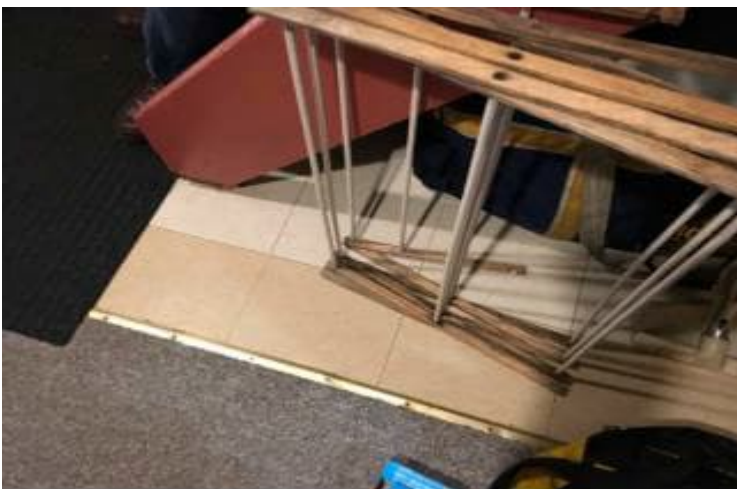
Photo 3: View of non-asbestos-containing vinyl floor tiles (12"x12"-grey w/ beige) observed throughout the basement of the subject building.