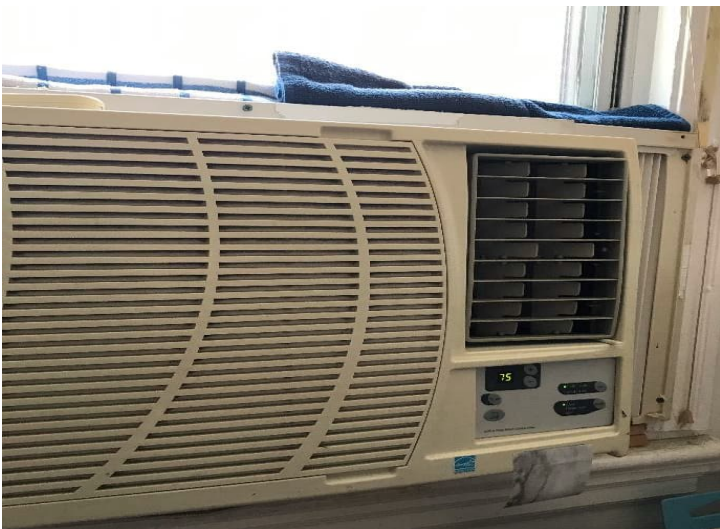
Photo 6: Typical view of the air-conditioning unit containing ozone-depleting substances.