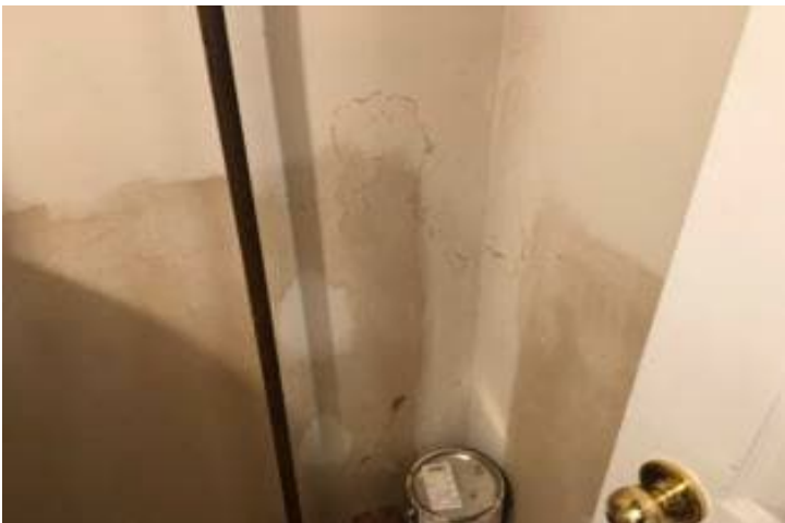
Photo 5: Typical view of non-asbestos-containing drywall joint compound observed throughout the subject building.