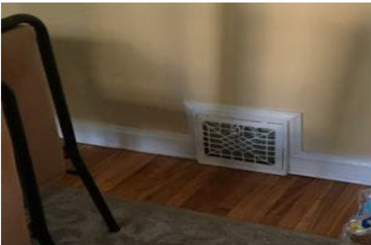
Photo 2: View of typical interior finishes observed at the building located at 66 Templeton Street.