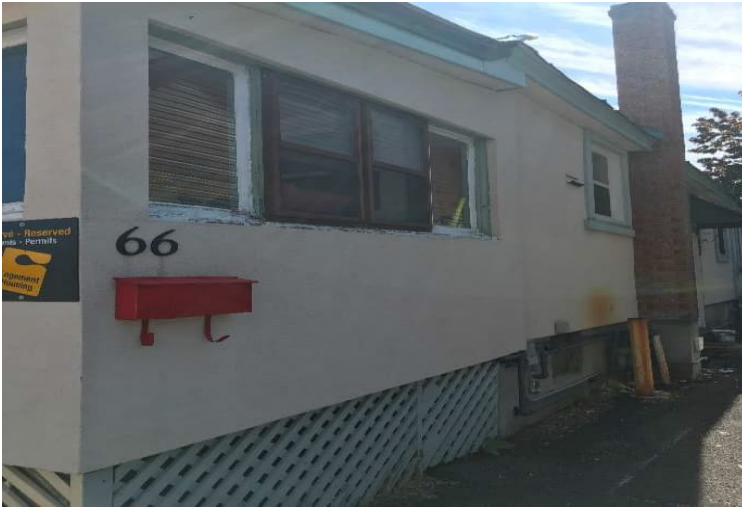
Photo 1: View of typical exterior finishes observed at the building located at 66 Templeton Street.