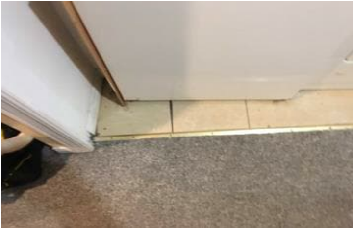
Photo 4: View of non-asbestos-containing vinyl floor tiles (12"x12"-beige) observed throughout the basement of the subject building.