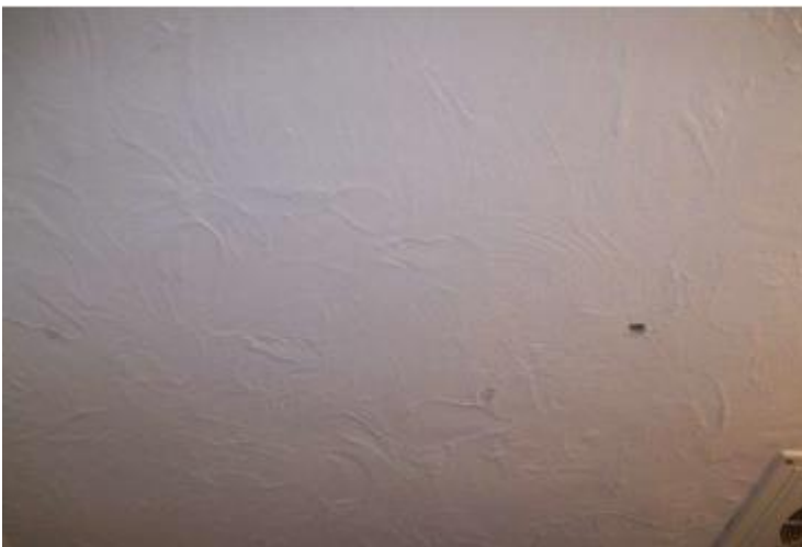
Photo 2: View of asbestos-containing texture coat (random wavy) observed in the bathroom of the subject building.