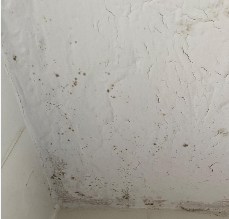
Photo 6: View of poor condition ceiling texture coat observed in Room 104 with mould.