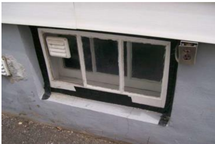
Photo 4: View of lead-containing white paint observed on the window frame on the exterior of the subject building.