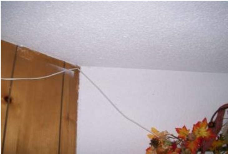
Photo 1: View of asbestos-containing texture coat (stipple) observed in the basement of the subject building.