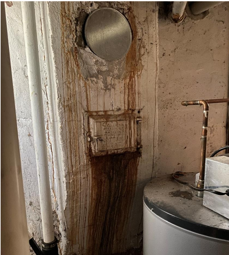
Photo 7: View of water damage observed in the basement laundry room