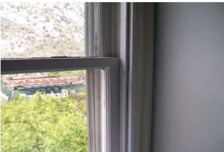
Photo 3: View of lead-containing white paint observed on the window frame in the living room within the subject building.