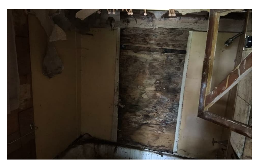
Photo 6: View of suspected mould growth observed on the plywood in the washroom.

Photo 5: View of brown and purple lead-containing paint and low concentrations of lead beige paint observed to be damaged near the entrance of the subject building.