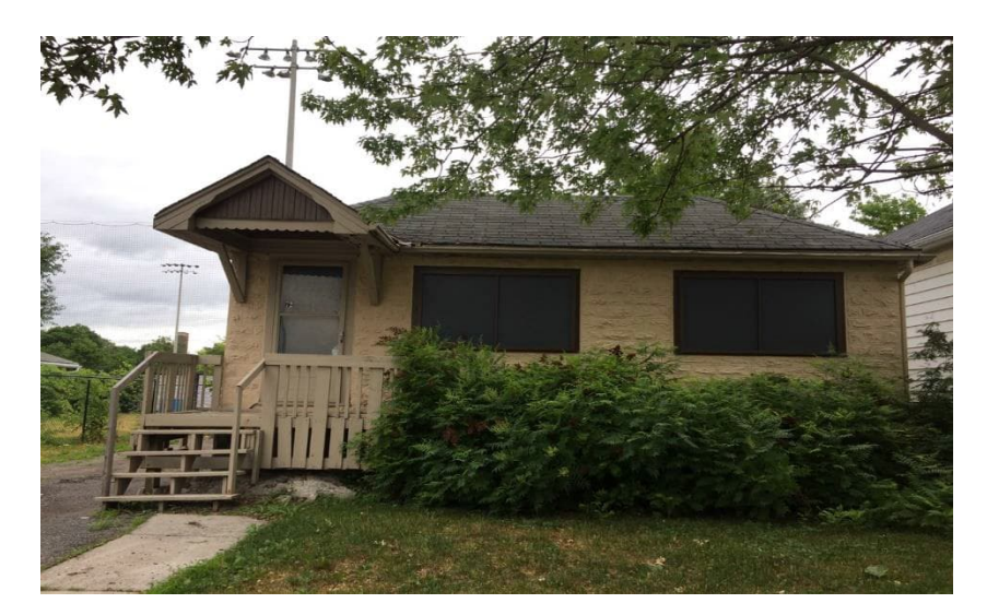
Photo 1: Exterior view of building located at 72 Templeton Street, Ottawa, ON.