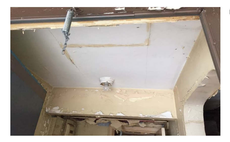
Photo 4: View of brown leadcontaining paint and low concentrations of lead beige paint observed to be damaged near the entrance of the