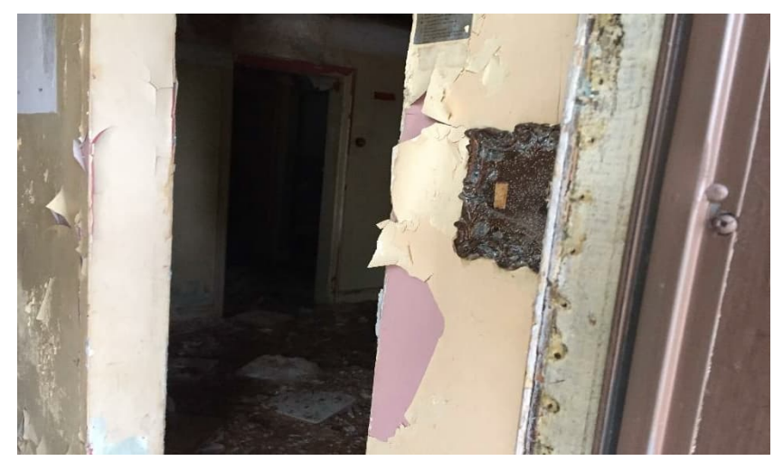
Photo 5: View of brown and purple lead-containing paint and low concentrations of lead beige paint observed to be damaged near the entrance of the subject building.