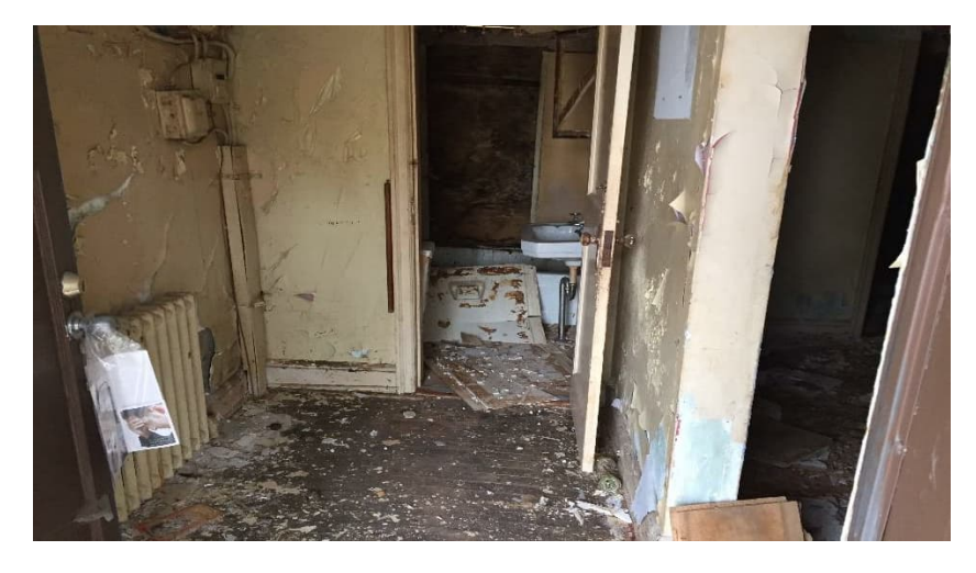
Photo 3: Typical view of damaged building materials observed within the subject building.