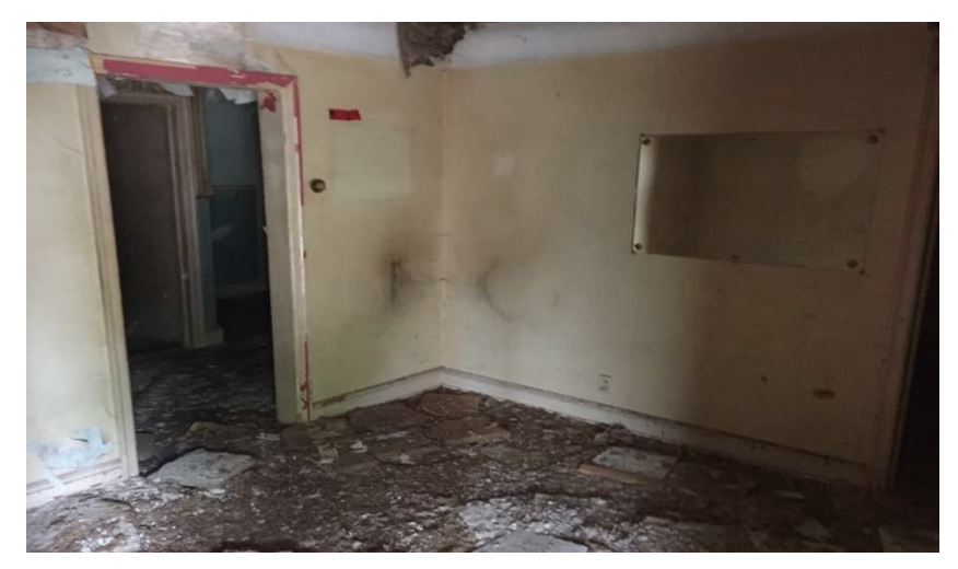
Photo 2: Typical view of damaged building materials observed within the subject building.