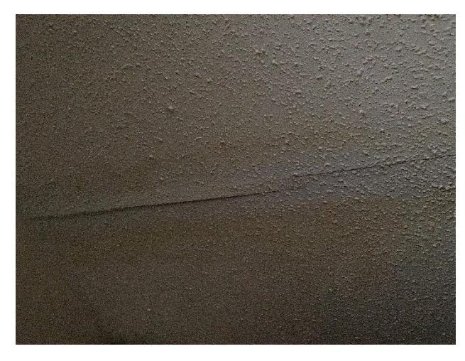
Photo 4: View of water damaged ceiling texture coat observed in apartment 198 - bedroom of 620 King Edward