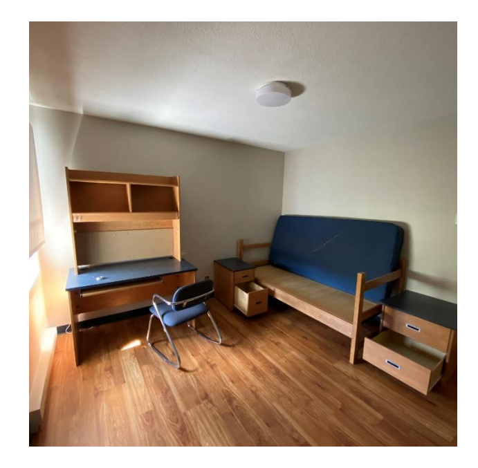
Photo 1: View of typical finished observed throughout the subject building bedrooms