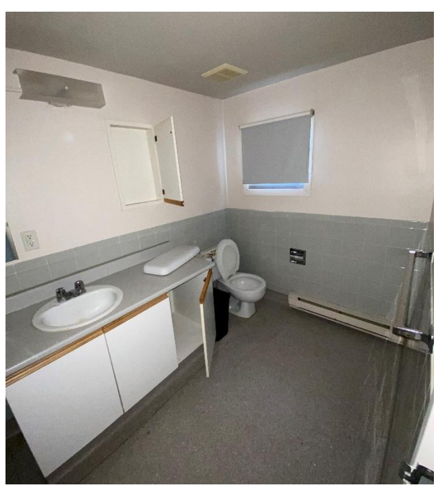
Photo 2: View of typical finished observed throughout the subject building bathrooms

Photo 1: View of typical finished observed throughout the subject building bedrooms