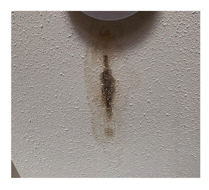
Photo 8: View of water damaged ceiling texture coat observed in apartment 184 - hallway of 75 Louis-Pasteur

Photo 7: View of water damaged ceiling texture coat observed in apartment 187 – living rooms of 75 Louis-Pasteur