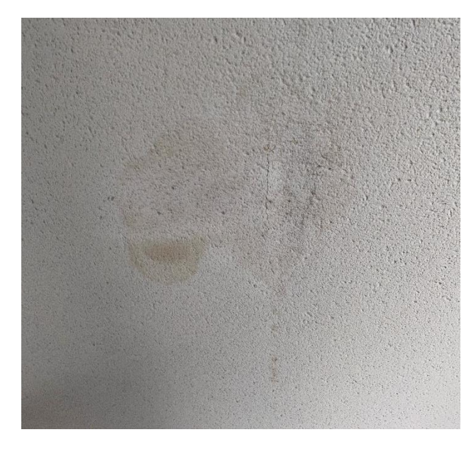
Photo 5: View of water damaged ceiling texture coat observed in apartment 196 – living room of 620 King Edward

Photo 4: View of water damaged ceiling texture coat observed in apartment 198 - bedroom of 620 King Edward