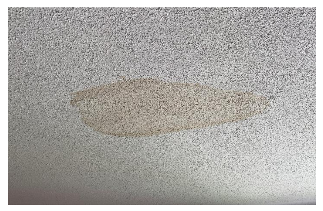
Photo 7: View of water damaged ceiling texture coat observed in apartment 187 – living rooms of 75 Louis-Pasteur