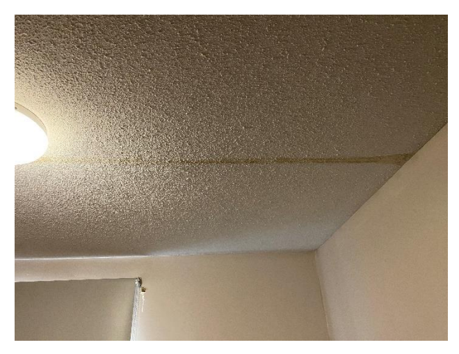
Photo 2: View of water damaged ceiling texture coat observed in apartment 76 – bedroom of 630 King Edward

Photo 1: View of water damaged ceiling texture coat observed in apartment 81 – living room of 630 King Edward