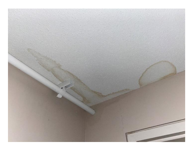
Photo 3: View of water damaged ceiling texture coat observed in apartment 73 doorway of 630 King Edward

Photo 2: View of water damaged ceiling texture coat observed in apartment 76 – bedroom of 630 King Edward