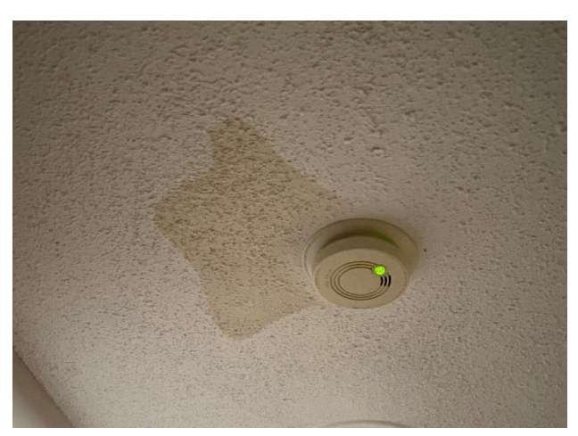
Photo 5: View of water damaged ceiling texture coat observed in apartment 90 – hallway of 632 King