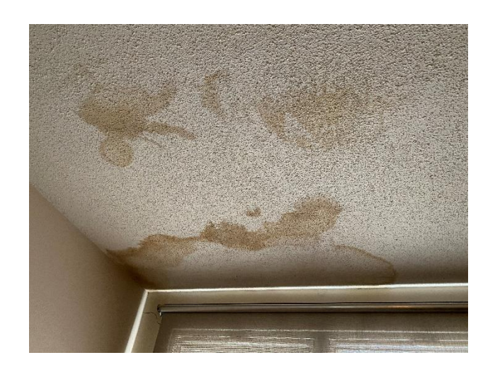
Photo 1: View of water damaged ceiling texture coat observed in apartment 81 – living room of 630 King Edward