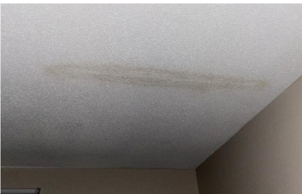
Photo 5: View of water damaged ceiling texture coat observed in apartment 4 - bedroom of 638 King Edward