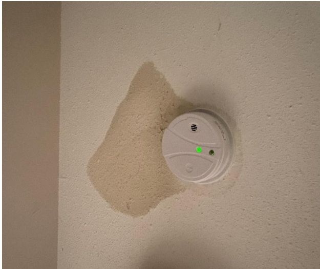
Photo 6: View of water damaged ceiling texture coat observed in apartment 1 - bedroom of 638 King Edward