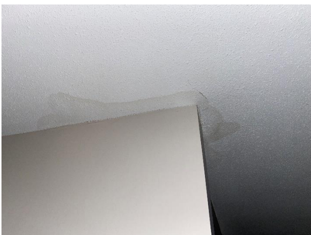
Photo 8: View of water damaged ceiling texture coat observed in apartment 17 - kitchen of 95 Marie Curie