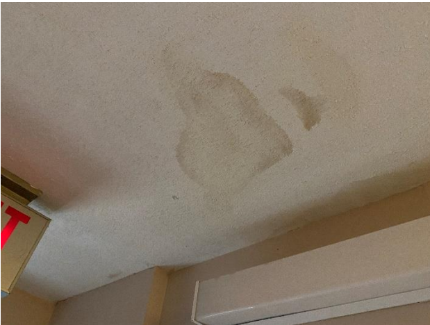
Photo 4: View of water damaged ceiling texture coat observed in the basement hallway of 638 King Edward