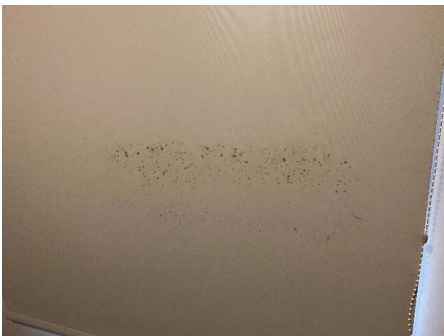
Photo 7: View of mould on window coverings observed in apartment 12 of 638 King Edward