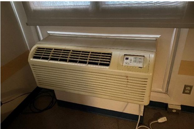
Photo 2: View of air conditioner observed throughout the buildings