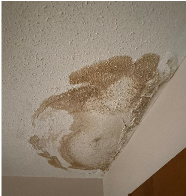
Photo 12: View of water damaged ceiling texture coat observed in apartment 29 – Dining Room of 85 Marie Curie