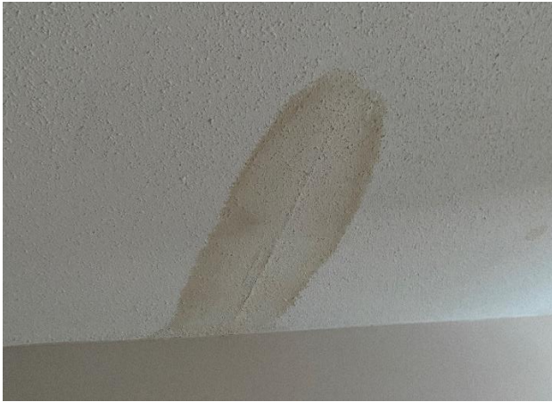
Photo 3: View of water damaged ceiling texture coat observed in apartment 9 - dining room of 638 King Edward