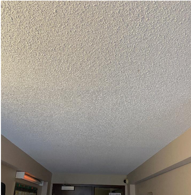
Photo 1: View of non-asbestos containing ceiling texture coat observed throughout the buildings