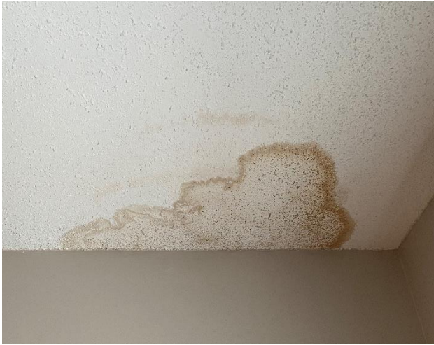
Photo 11: View of water damaged ceiling texture coat observed in apartment 35 – bedroom of 85 Marie Curie