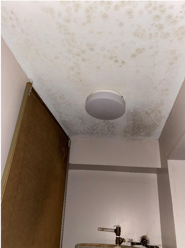
Photo 9: View of mould on ceiling of the hot water tank storage closet observed in apartment 18 of 95 Marie Curie