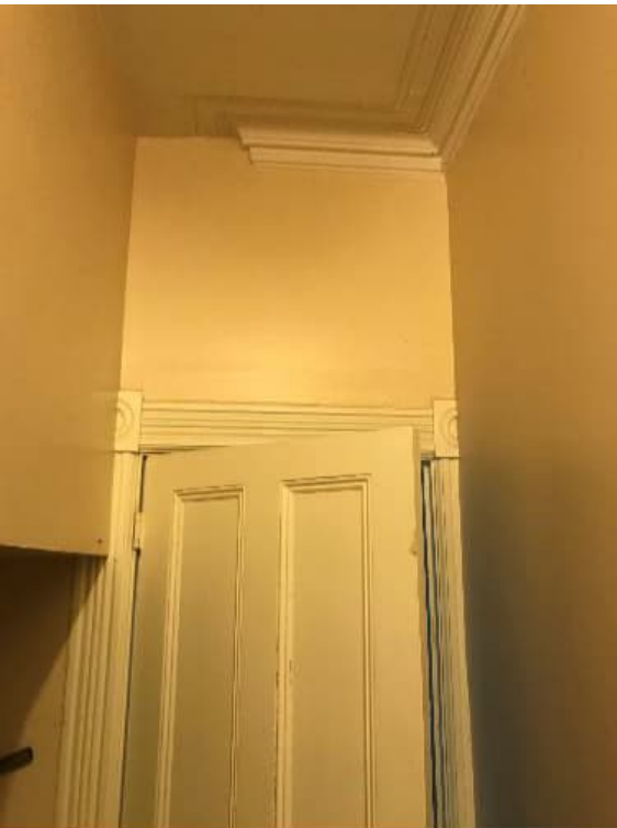
Photo 4: View of lead-containing white trim paint observed in good condition.