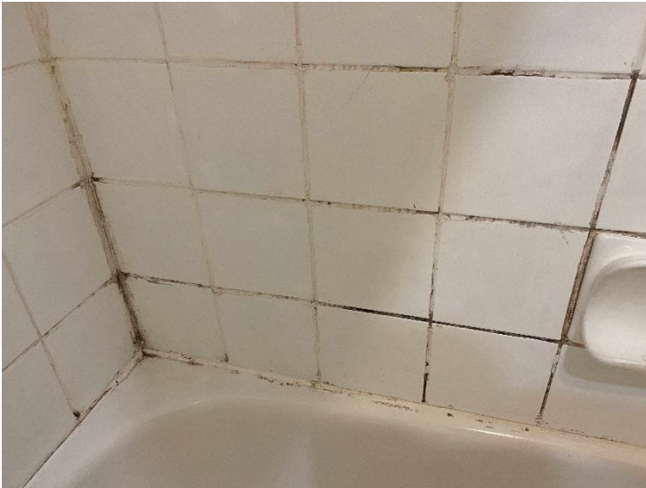
Photo 9: View of mould growth observed on the wall grout in the bathroom.