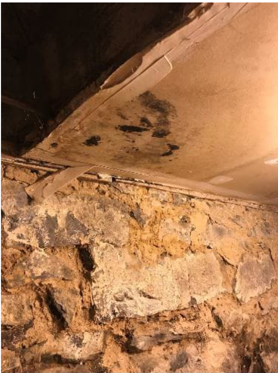
Photo 8: View of mould growth observed on the ceiling in the basement.