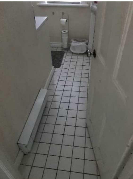
Photo 2: View of typical finishes observed at the building located at 62 Henderson Avenue.