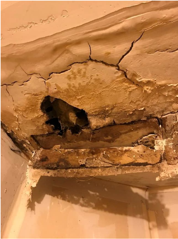
Photo 7: View of water damage/mould growth observed at the top of the basement stairs.