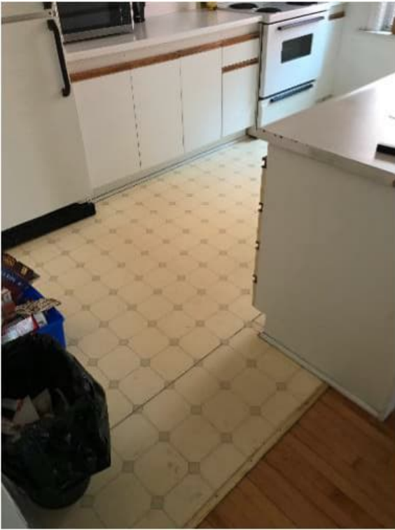
Photo 1: View of typical finishes observed at the building located at 62 Henderson Avenue.