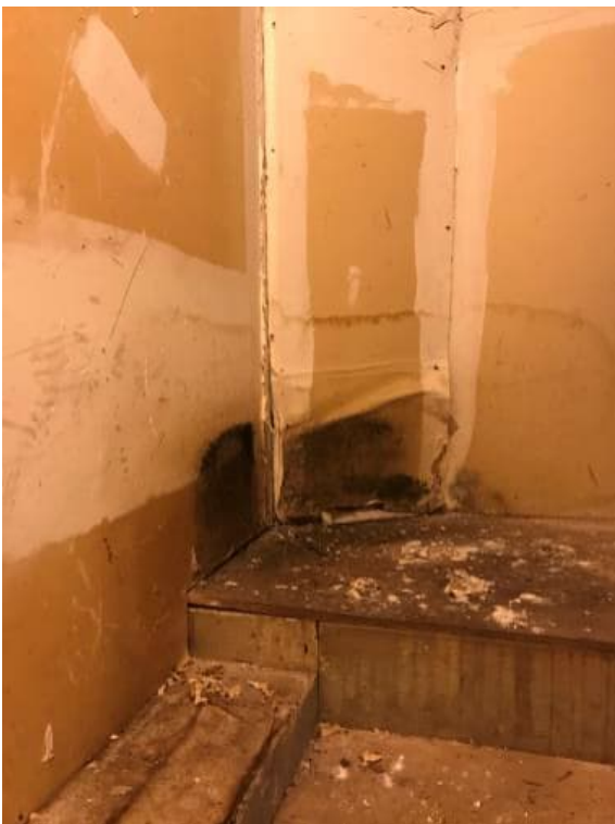
Photo 6: View of water damage/mould growth observed at the top of the basement stairs.