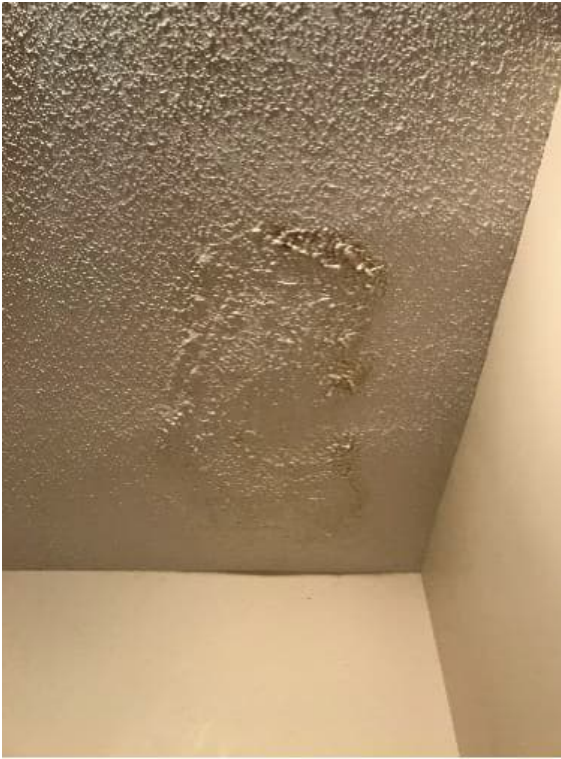
Photo 5: View of water-damaged texture coat in the bedroom on the first floor observed to be in poor condition.