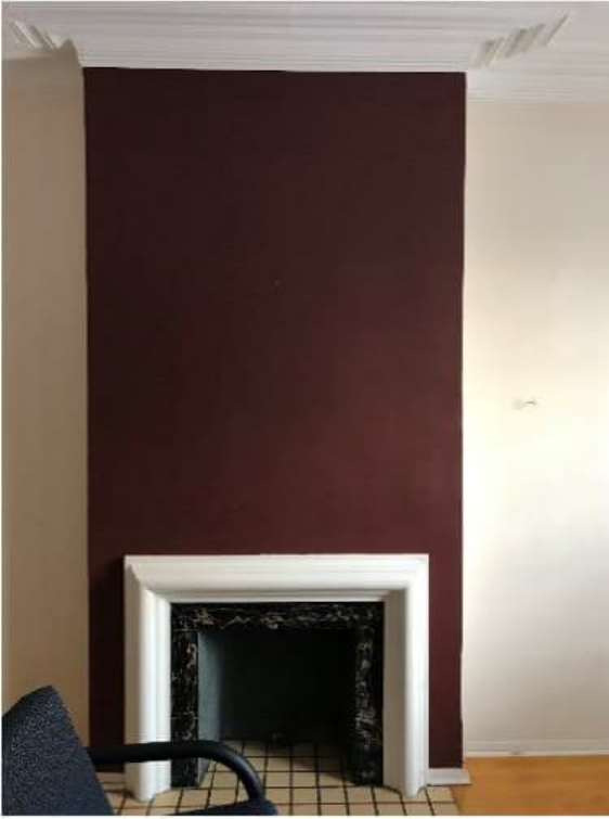
Photo 3: View of typical finishes observed at the building located at 62 Henderson Avenue.