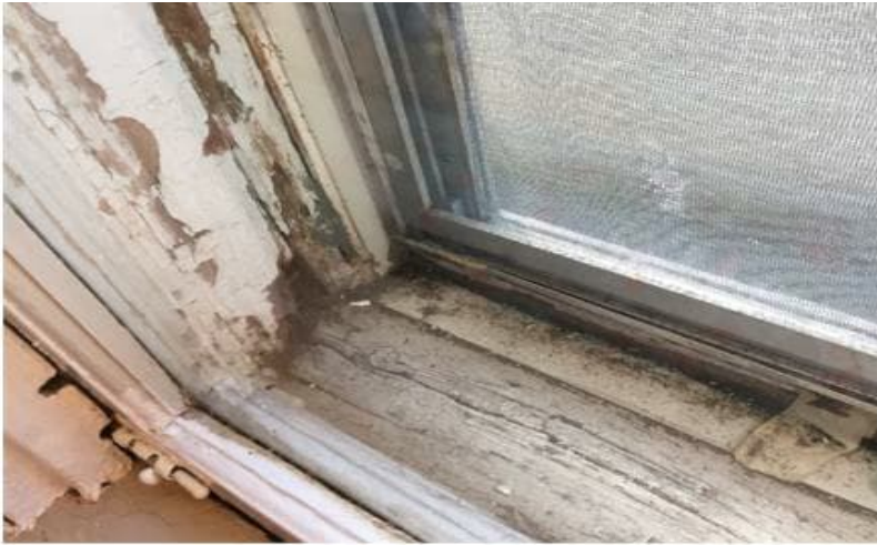
Photo 7: View of lead-containing white paint observed to be in poor condition in Room C on the 2 nd floor of the subject building.