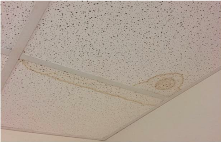
Photo 10: View of water damaged ceiling tiles observed in Room C on the 1 st floor of the subject building.