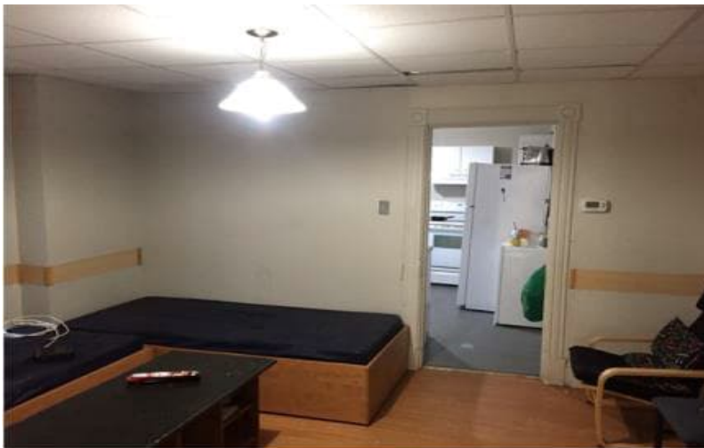
Photo 2: View of typical finishes observed at the building located at 112 Henderson Avenue.