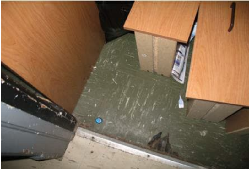
Photo 4: View of previously sampled asbestos-containing vinyl floor tile in the southside bedroom, now presumed to be under new flooring. (Ref. 0459870 (27))