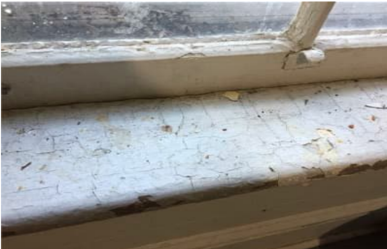
Photo 8: View of lead-containing white paint observed to be in poor condition in the kitchen on the 1 st floor of the subject building.