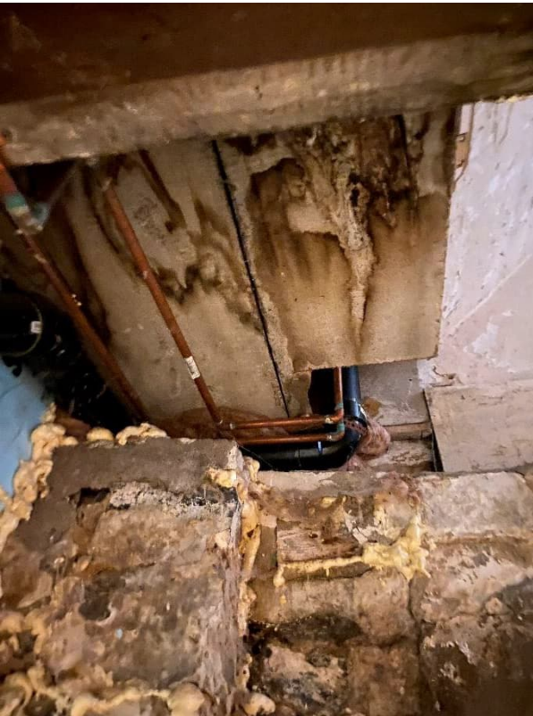
Photo 11: View of water damaged ceiling panels observed in the basement at the bottom of the stairwell.