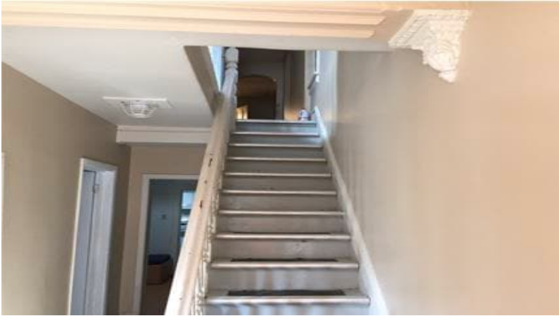
Photo 1: View of typical finishes observed at the building located at 112 Henderson Avenue.