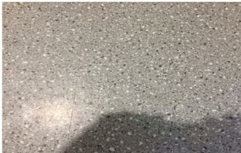
Photo 6: View of non-asbestos-containing vinyl sheet flooring observed in the kitchen on the 1 st floor of the subject building.