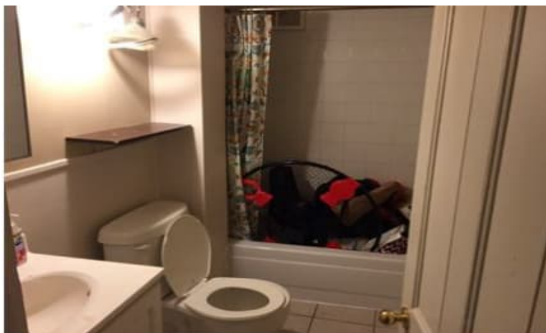
Photo 3: View of typical finishes observed at the building located at 112 Henderson Avenue.