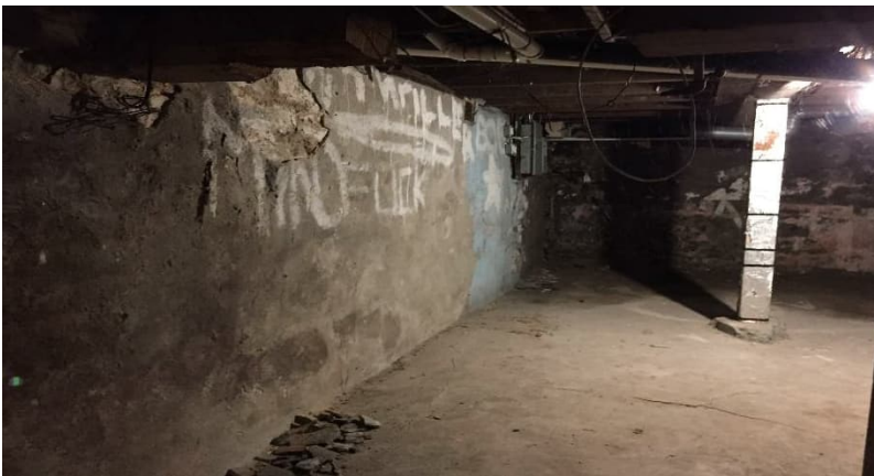
Photo 5: View of asbestos-containing texture coat observed to be in poor condition in the basement.