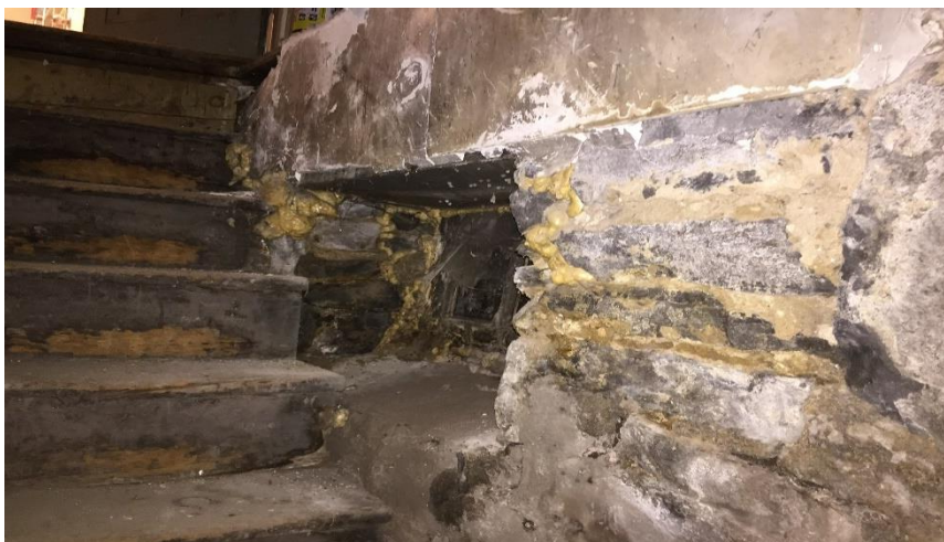
Photo 3: View of lead-containing paint (Grey) on plaster in poor condition in the Basement Room 003.