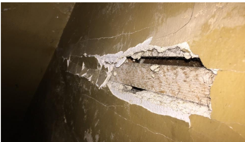
Photo 6: View of the lead-containing paint (Green) on plaster in poor condition in the Basement Room 003.