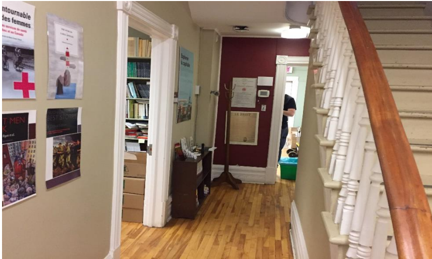
Photo 1: Representative view of typical finishes throughout the first level of subject building.