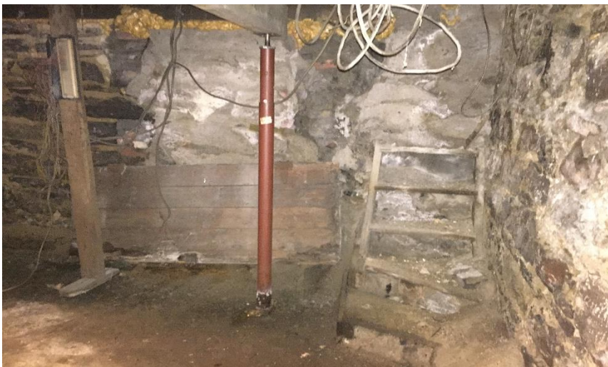
Photo 5: View damp staining on concrete floor in the Basement level.