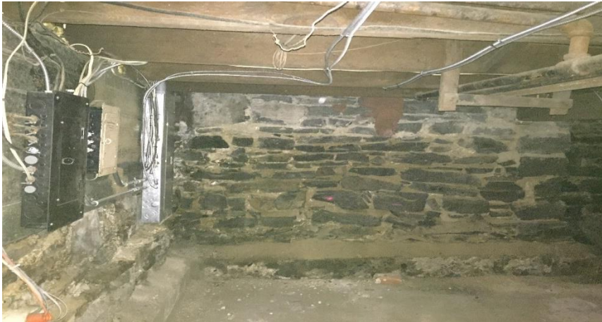
Photo 4: View damp staining on stone foundation wall in the Basement level.