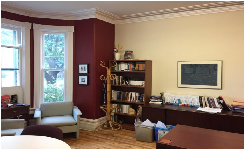
Photo 7: Representative view of non-asbestos finishes on the ground floor.