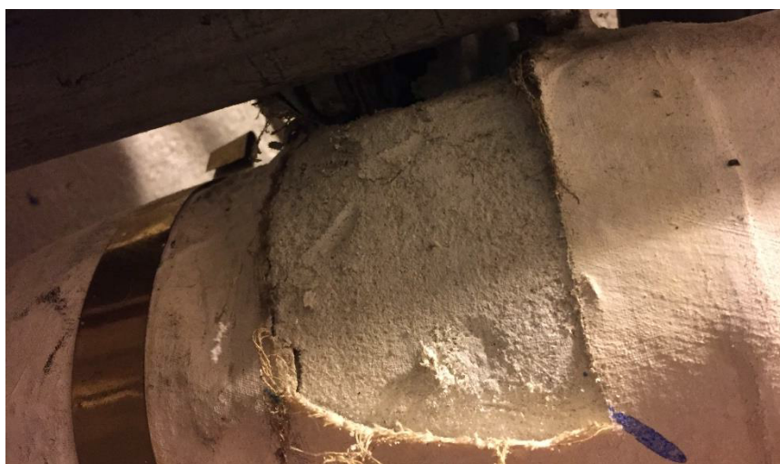
Photo 5: Representative view of the asbestos-containing pipe straight insulation observed in poor condition in Room B8.