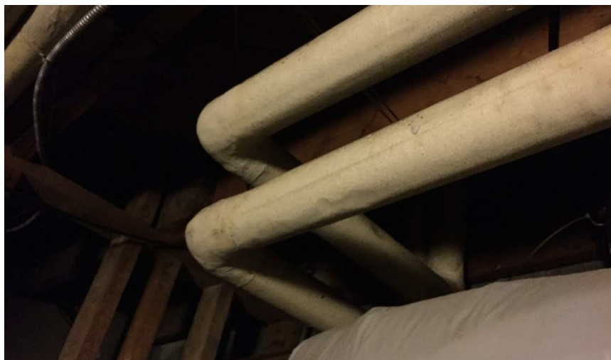
Photo 4: Representative view of the asbestos-containing parging cement elbows and pipe straight insulation observed in Room B8.