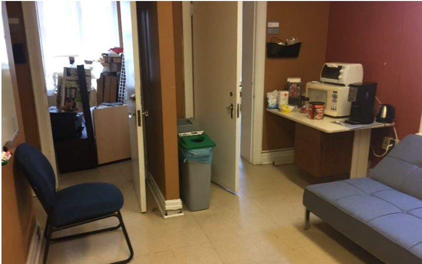
Photo 1: Representative view of the interior finishes observed throughout the subject building.