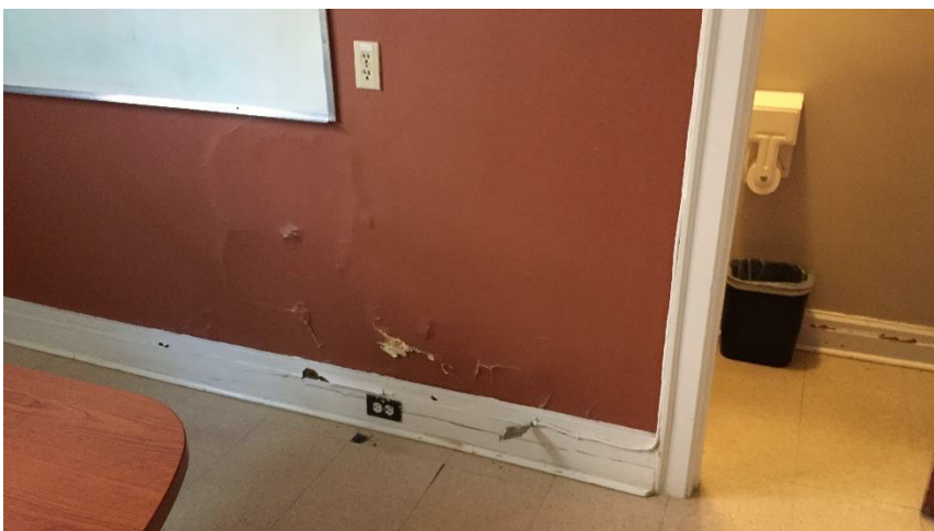
Photo 3: View of the lead-containing paint (Mahogany) observed in poor condition in Room B5.