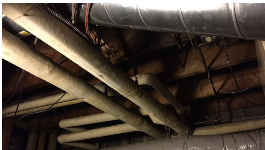
Photo 6: Representative view of the asbestos-containing parging cement elbows and pipe straight insulation observed in Room B10.