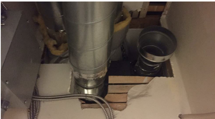
Photo 2: View of the non-asbestos containing wall and ceiling plaster observed throughout the subject building.