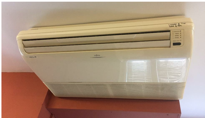
Photo 7: Representative view of equipment observed to contain ODSs throughout the subject building.