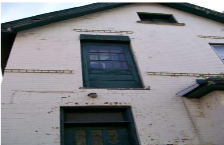
Photo 3: View of green and white lead-containing paint observed to be in poor condition on the exterior of the subject building.