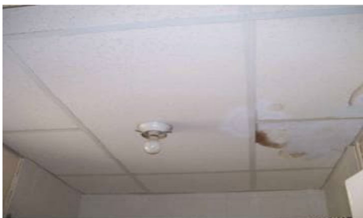
Photo 2: View of water damaged ceiling tiles observed in the bathroom (Room 106) on the 1 st floor of the subject building.