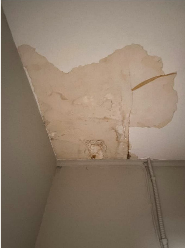
Photo 3: View of water damaged ceiling observed within Apartment 2 of the subject building.