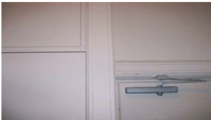
Photo 1: View of lead-containing white paint observed to be in good condition in the front entrance of the subject building.