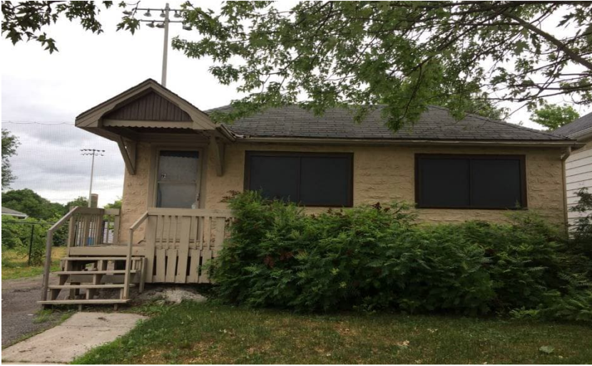
Photo 1: Exterior view of building located at 72 Templeton Street, Ottawa, ON.