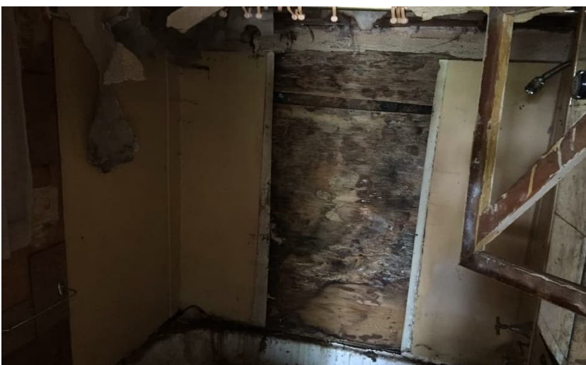
Photo 6: View of suspected mould growth observed on the plywood in the washroom.