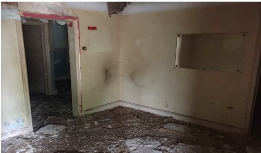
Photo 2: Typical view of damaged building materials observed within the subject building.