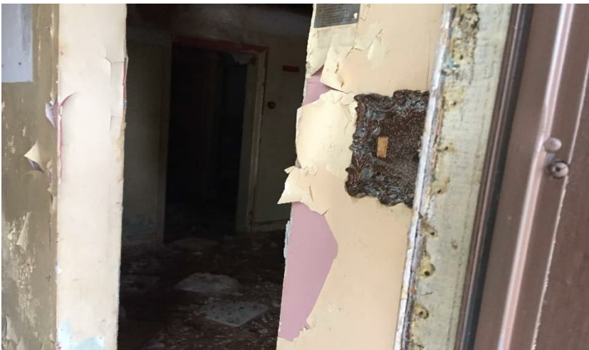
Photo 5: View of brown and purple lead-containing paint and low concentrations of lead beige paint observed to be damaged near the entrance of the subject building.