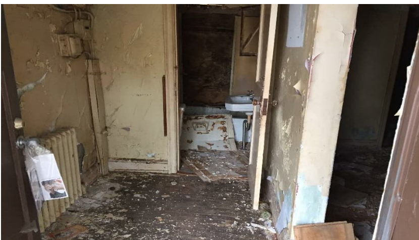
Photo 3: Typical view of damaged building materials observed within the subject building.