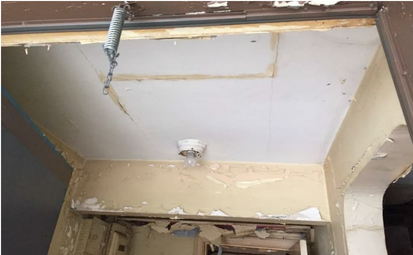
Photo 4: View of brown lead-containing paint and low concentrations of lead beige paint observed to be damaged near the entrance of the subject building.