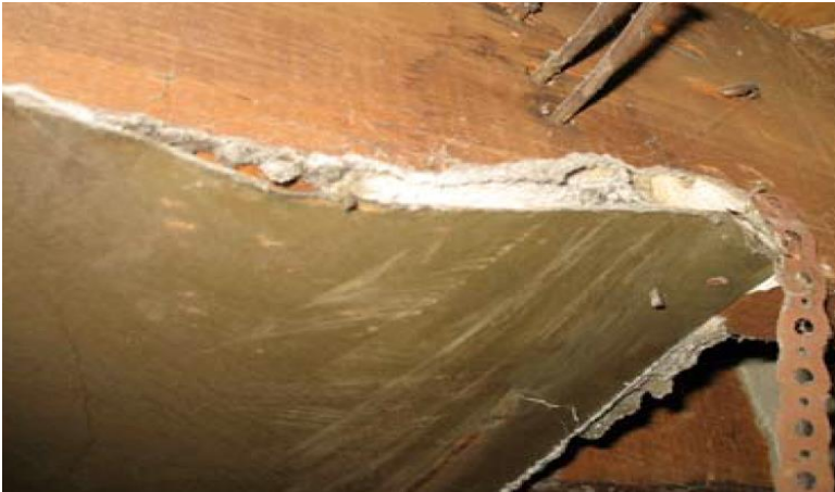
Photo 2: A view of asbestos-containing paper duct insulation observed in the basement of the subject building.