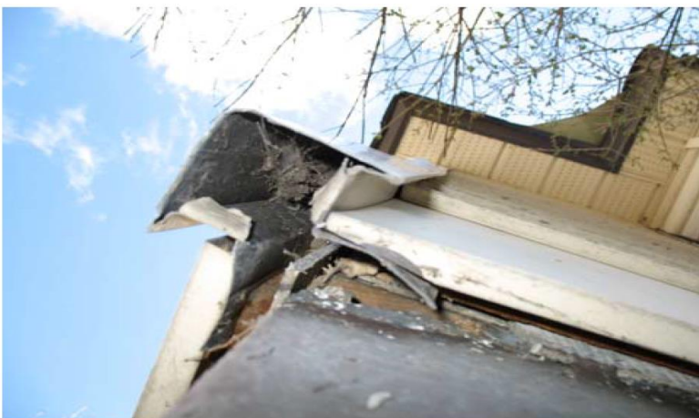
Photo 3: A view of asbestos-containing transite siding observed underneath the metal siding on the exterior of the subject building.