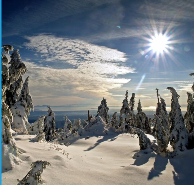
Enemy - Sun