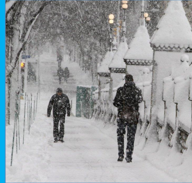
Ally - Snow