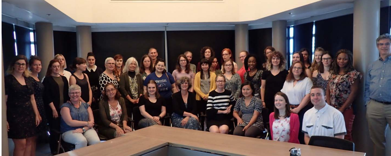
Orientation session, September 2018