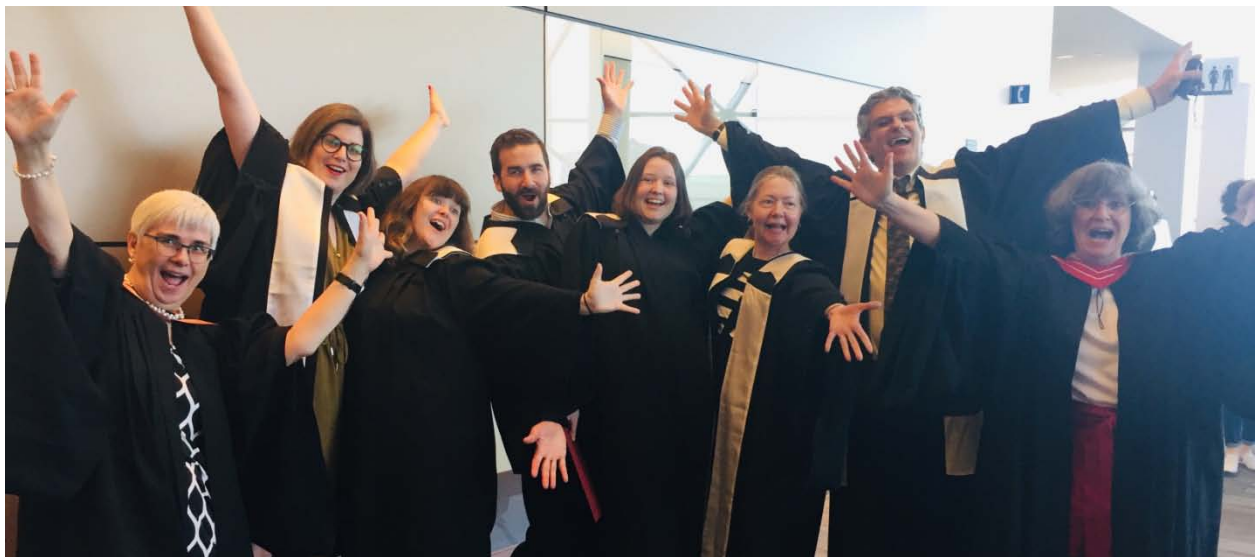
Convocation, June 2019