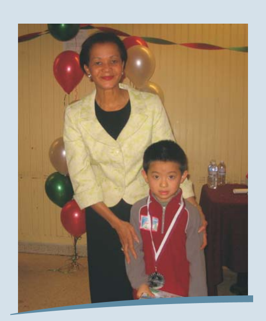
1<sup>st</sup> PRIZE – 5 to 7 age category

We thank all participants, parents, and staff of participating schools for having once again made this annual event a success.