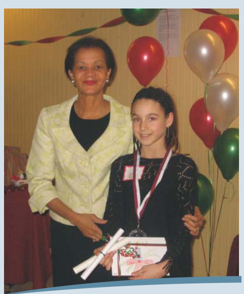
1<sup>st</sup> PRIZE – 8 to 10 age category