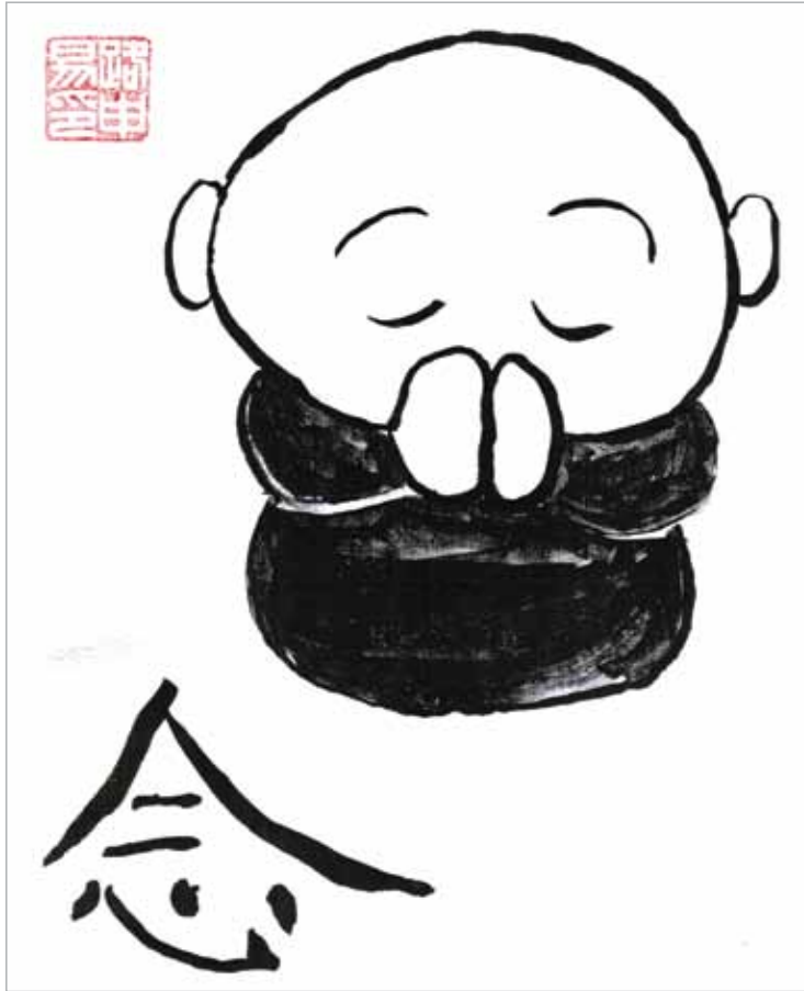
Illustration Olivia Shenyi Lu

the isolated components. Acceptance of the self and others does not mean an end to striving for improvement in health; but rather, it creates a comfortable basis to make reasonable progress in developmentally appropriate programs.