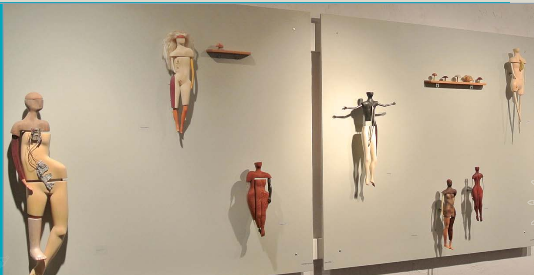
Panels of dolls from Constructed Identities by Persimmon Blackbridge