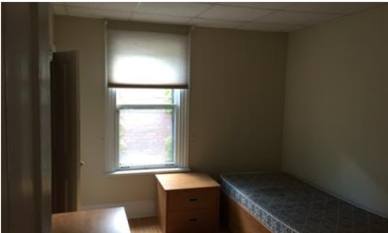
Photo 2: View of typical finishes observed at the building located at 116 Henderson Avenue.