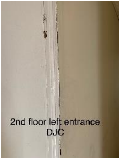
Photo 6: View of ACM drywall joint compound in fair condition was observed on the second floor entrance stairwell of the subject building.