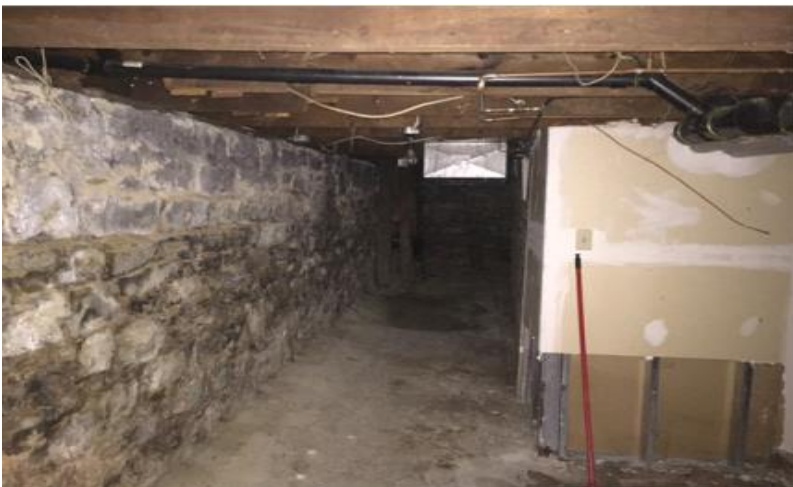
Photo 3: View of typical finishes observed at the building located at 116 Henderson Avenue.