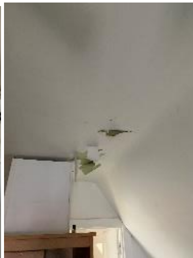
Photo 9: View of lead-containing white paint observed to be in poor condition on the ceiling of 3 rd floor bedroom.