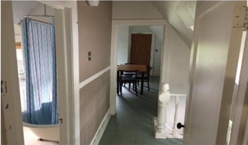
Photo 1: View of typical finishes observed at the building located at 116 Henderson Avenue.