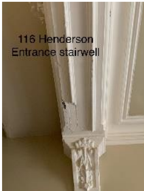
Photo 5: View of ACM drywall joint compound in fair condition was observed on the first-floor entrance stairwell of the subject building.