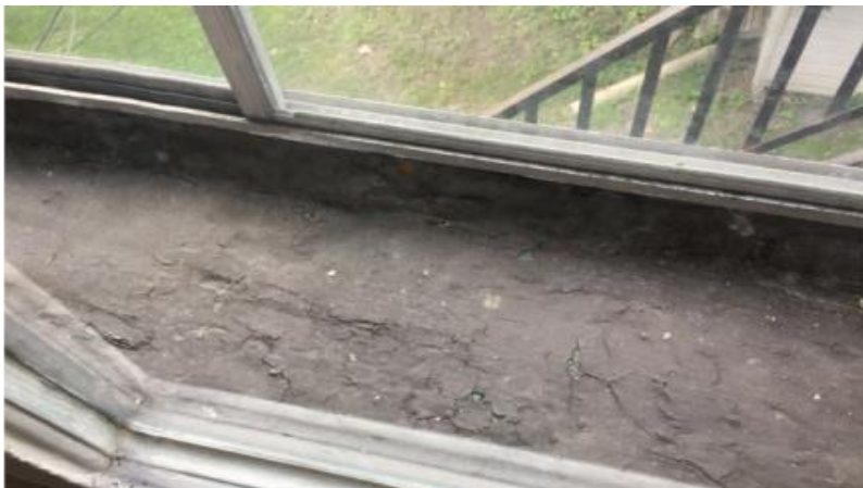
Photo 11: View of lead-containing brown paint observed to be in poor condition in the kitchen.