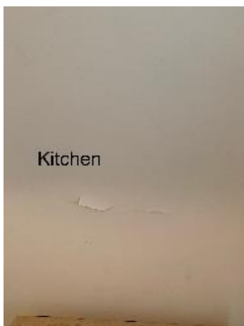
Photo 10: View of lead-containing white paint observed to be in fair condition on the wall of 1 st floor kitchen.