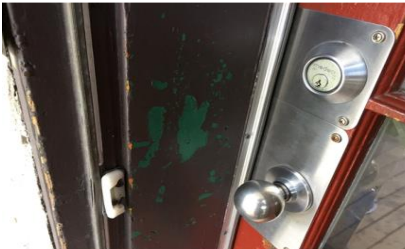
View of lead-containing dark grey paint observed to be in poor condition on the front door.