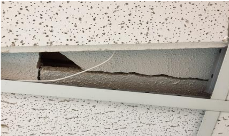
Photo 4: View of suspended ceiling tiles with a ceiling texture coat above, as observed in Room A on the second floor.