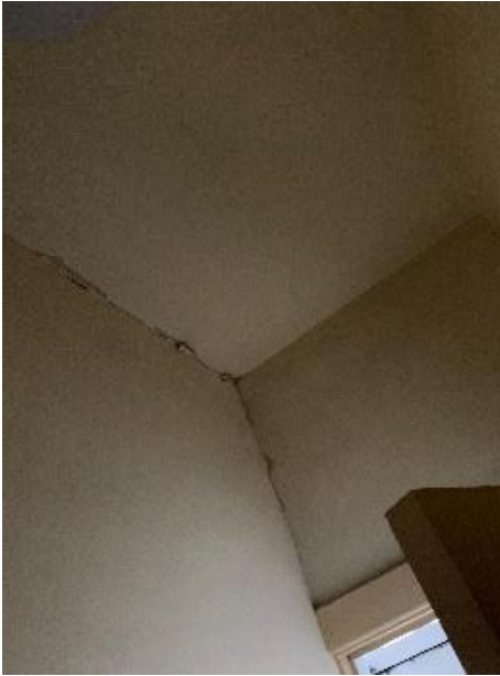
Photo 5: View of lead-containing ceiling and wall paint observed to be in poor condition located within Unit 202.