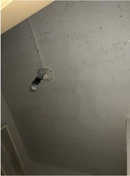
Photo 3: View of mould-affected drywall ceiling observed to be in poor condition located in the Washroom of Unit 202.