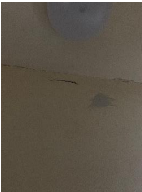
Photo 6: View of lead-containing ceiling and wall paint observed to be in poor condition located within Unit 202.