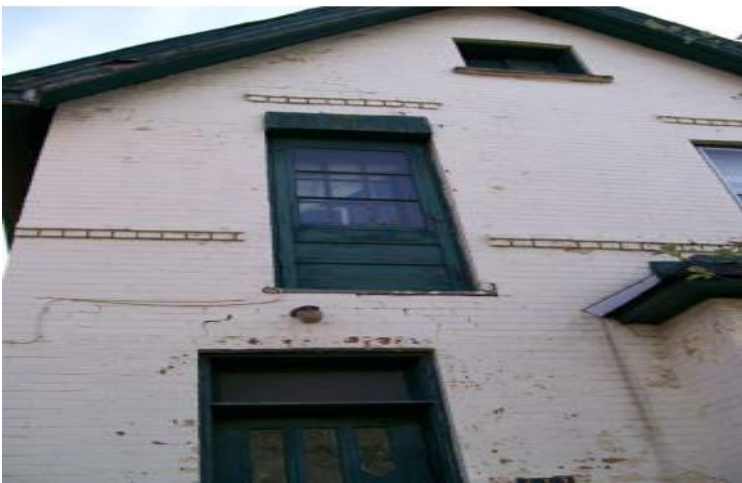
Photo 8: View of green and white lead-containing paint observed to be in poor condition on the exterior of the subject building.