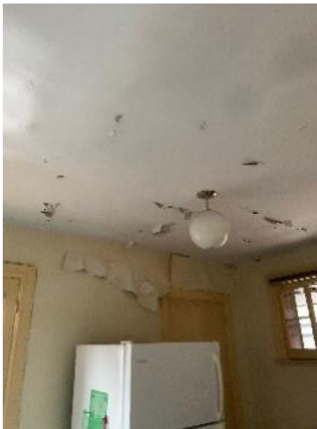
Photo 4: View of lead-containing ceiling and wall paint observed to be in poor condition located within the Kitchen of Unit 202.