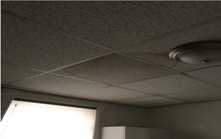
Photo 1: View of water damaged ceiling tiles (2'x2') observed in the kitchen within the subject building.