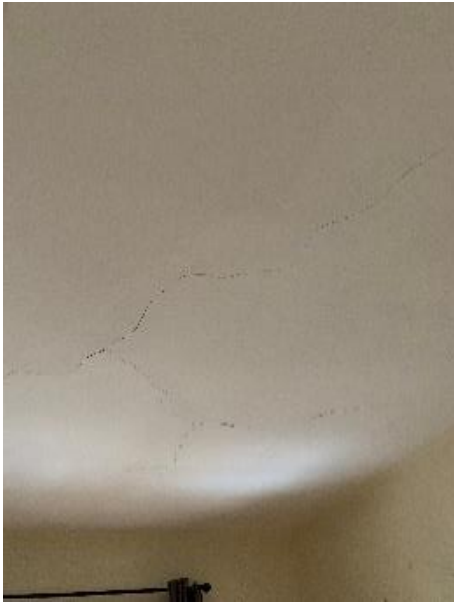
Photo 7: View of lead-containing ceiling and wall paint observed to be in poor condition located within Room A of Unit 202.