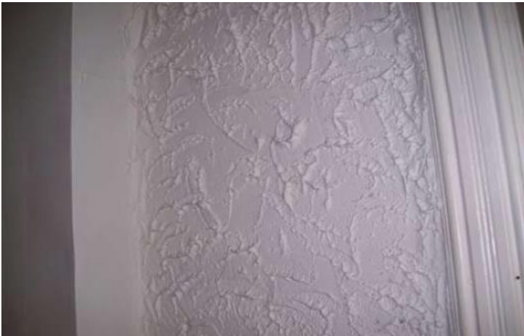
Photo 2: View of the non-asbestos-containing texture coat observed in the front room on the 1 st floor of the subject building.