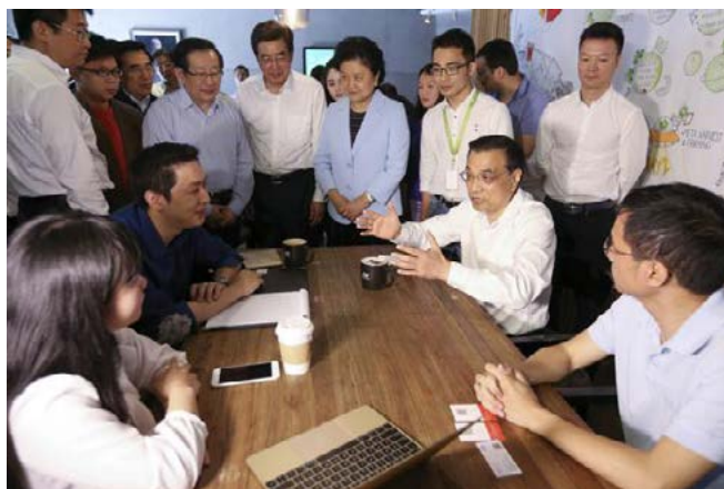
Premier Li Keqiang chats with young entrepreneurs at 3W Coffee 43

to discuss incubators and start-ups with young entrepreneurs. Photos of Premier Li appeared widely in the media, and people came to 3W from all over Beijing to sit at the same table and drink the same coffee as Premier Li. This has given a huge boost to coffee incubators which were already well subscribed for the services they offer to up and coming innovation entrepreneurs. The environment is very much one of mutual support and learning from one another. In addition to 3W, we visited Garage Café and 36Kr , and all three incubators indicated that they are developing plans to link internationally.